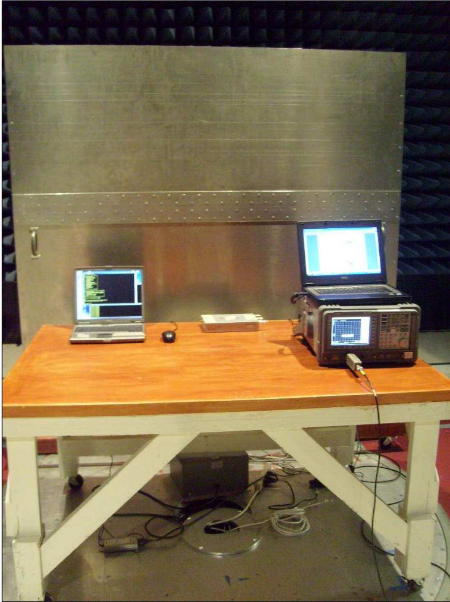
Photograph 3. Conducted Emissions, Test Setup