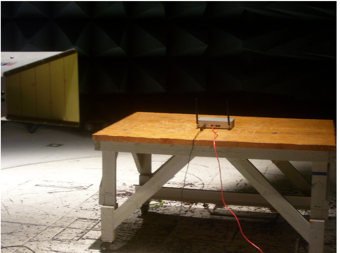
Test Equipment and setup for various Radiated Measurements (5dbi Omni Antenna)