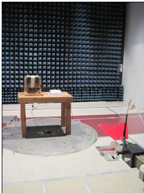
Photograph 3. Radiated Emission, 1GHz – 2GHz, Test Setup