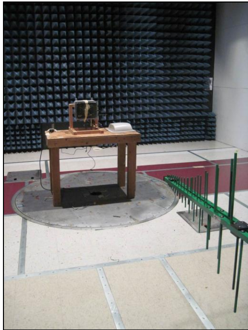
Photograph 2. Radiated Emission, 30MHz – 1GHz, Test Setup