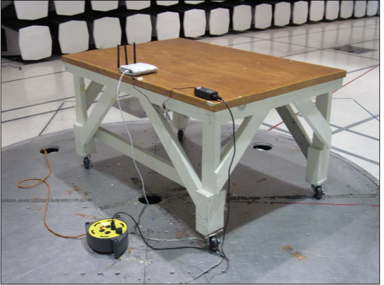
Photograph 9. Radiated Emission, Test Setup