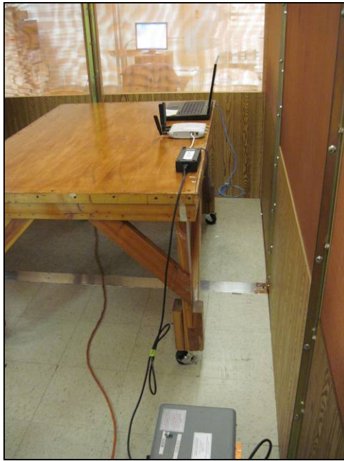
Photograph 6. Conducted Emissions, Test Setup 2, PoE30U-560