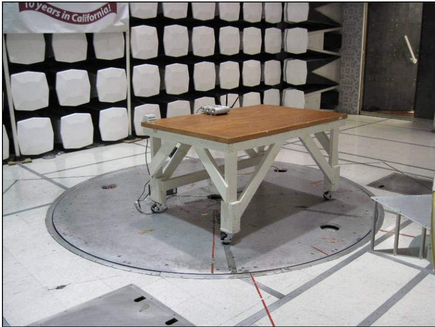
Photograph 8. Radiated Emission, Test Setup, Above 1 GHz