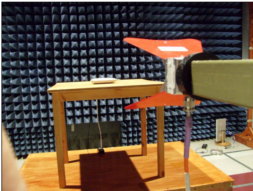
Photograph 2 Radiated Emission Spurious Test Setup, 1 GHz – 18 GHz