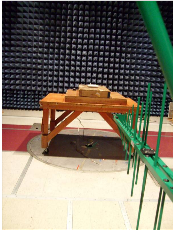
Photograph 1. Radiated Emission Spurious Test Setup, 30 MHz – 1 GHz