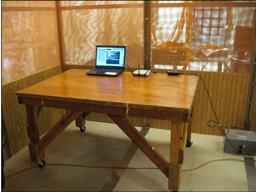
Photograph 3. Conducted Emissions, Test Setup 1, FSP040-DGAA5