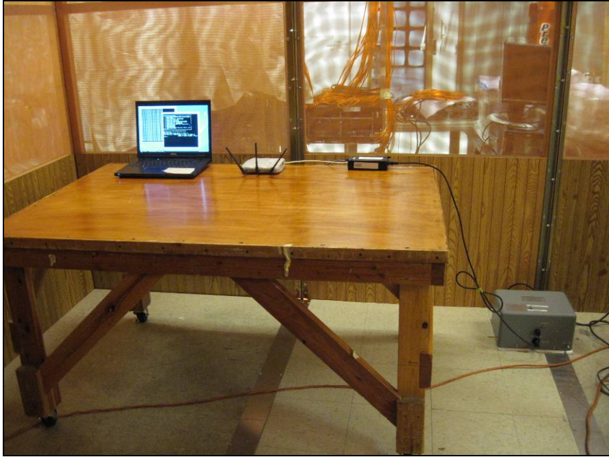
Photograph 5. Conducted Emissions, Test Setup 1, PoE30U-560