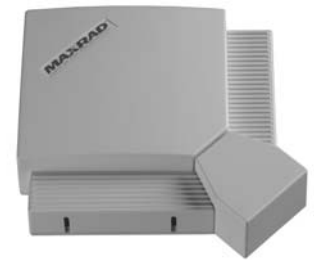
MP24008XFPT or MP19008XFPT or MP58013XFPT