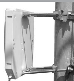
MP24013XFPT on MPAB8 Outdoor Mount