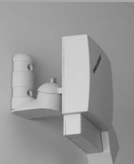
MP58013XFPT or MP24008XFPT or MP19008XFPT on MPAB11 Mount