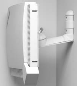
MP24013XFPT on MPAB12 Corner Mount