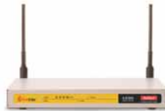
Firetide HotPort/PS Indoor Mesh Node

A jurisdictional HotPort/PS mesh network can provide broadband communications for both intra-agency and interoperable multi-agency needs, including mutual aid. Any organization authorized for 4.9 GHz—local/state police, SWAT, National Guard, fire, EMS, hospitals, FEMA, mass transit, utilities and others—can utilize the license granted to the jurisdiction. HotPort 3100/PS series indoor nodes, which operate seamlessly with HotPort 3200/PS outdoor nodes, can be used to extend the jurisdictional mesh into command centers, city halls and other facilities on a temporary or permanent basis.