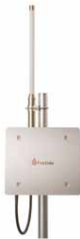
Firetide HotPort/PS Outdoor Mesh Node

Access points can optionally be deployed, indoors or outdoors, to provide first responders and other public safety officials with commercial Wi-Fi communications. Because the mesh is a multi-point-to-multipoint network, and not point-to-point, FCC restrictions on permanent installations do not apply. This same characteristic also allows a HotPort/PS mesh to overcome the many line-of-sight obstructions that cause problems with other wireless technologies.