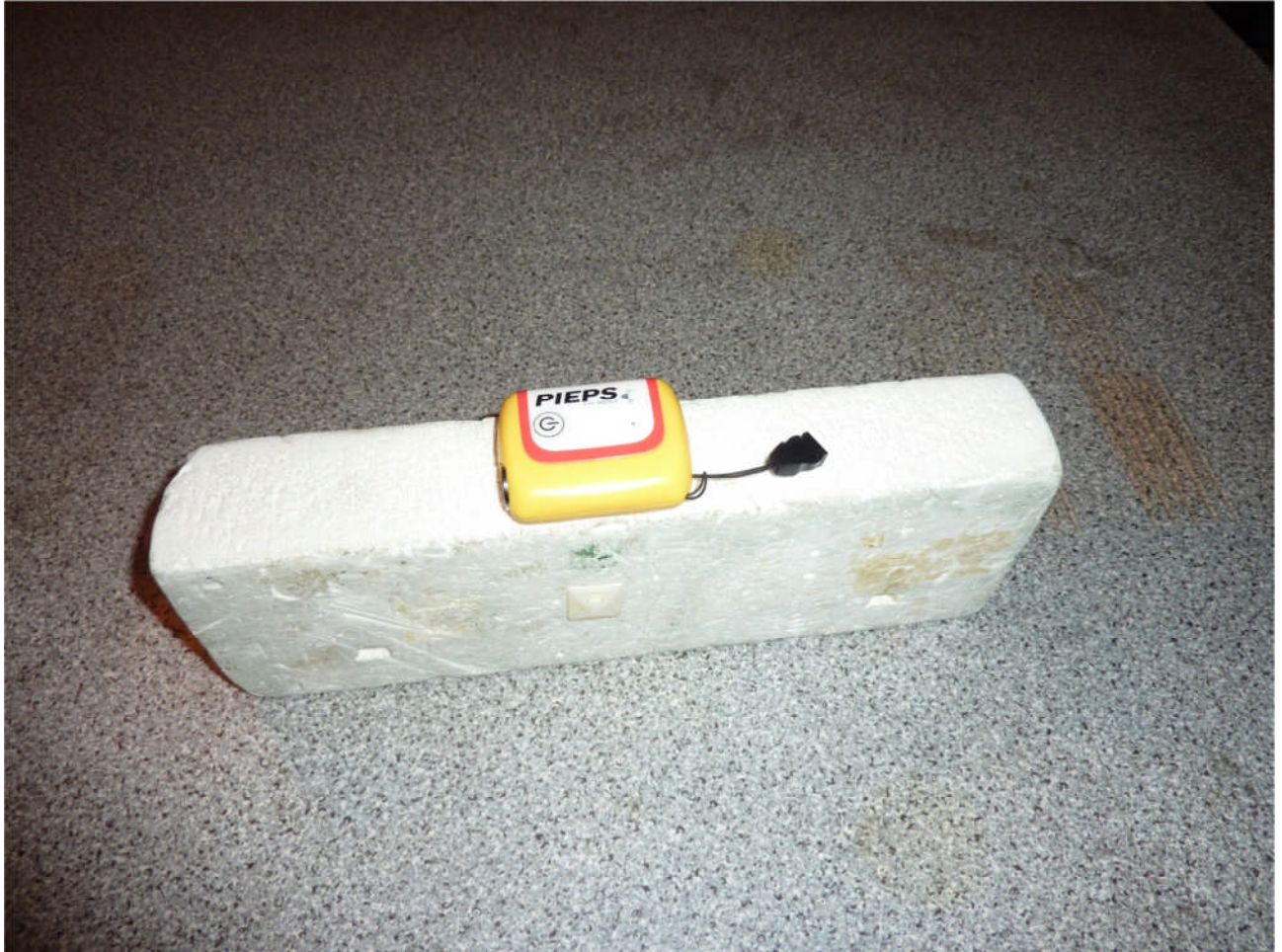
113540emi2.JPG: Test set-up radiated emission (E-Field)