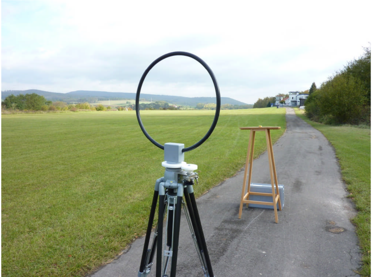
113540emi3.JPG: Test set-up final radiated emission (H-Field)