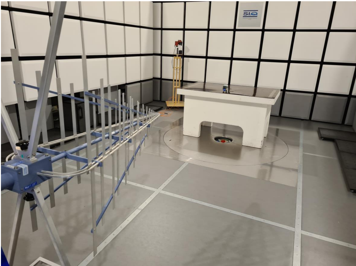
Figure 2: Spurious emission 30 MHz-1000 MHz