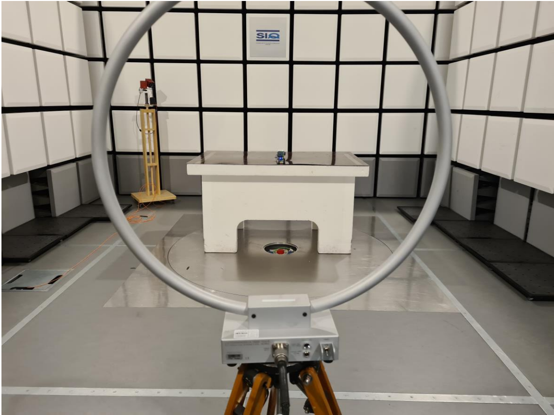
Figure 1: Spurious emission 9 kHz - 30 MHz