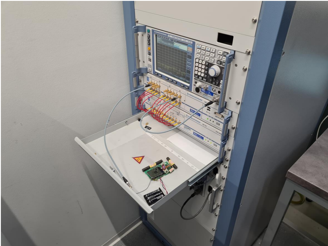
Figure 5: Conducted measurements test setup