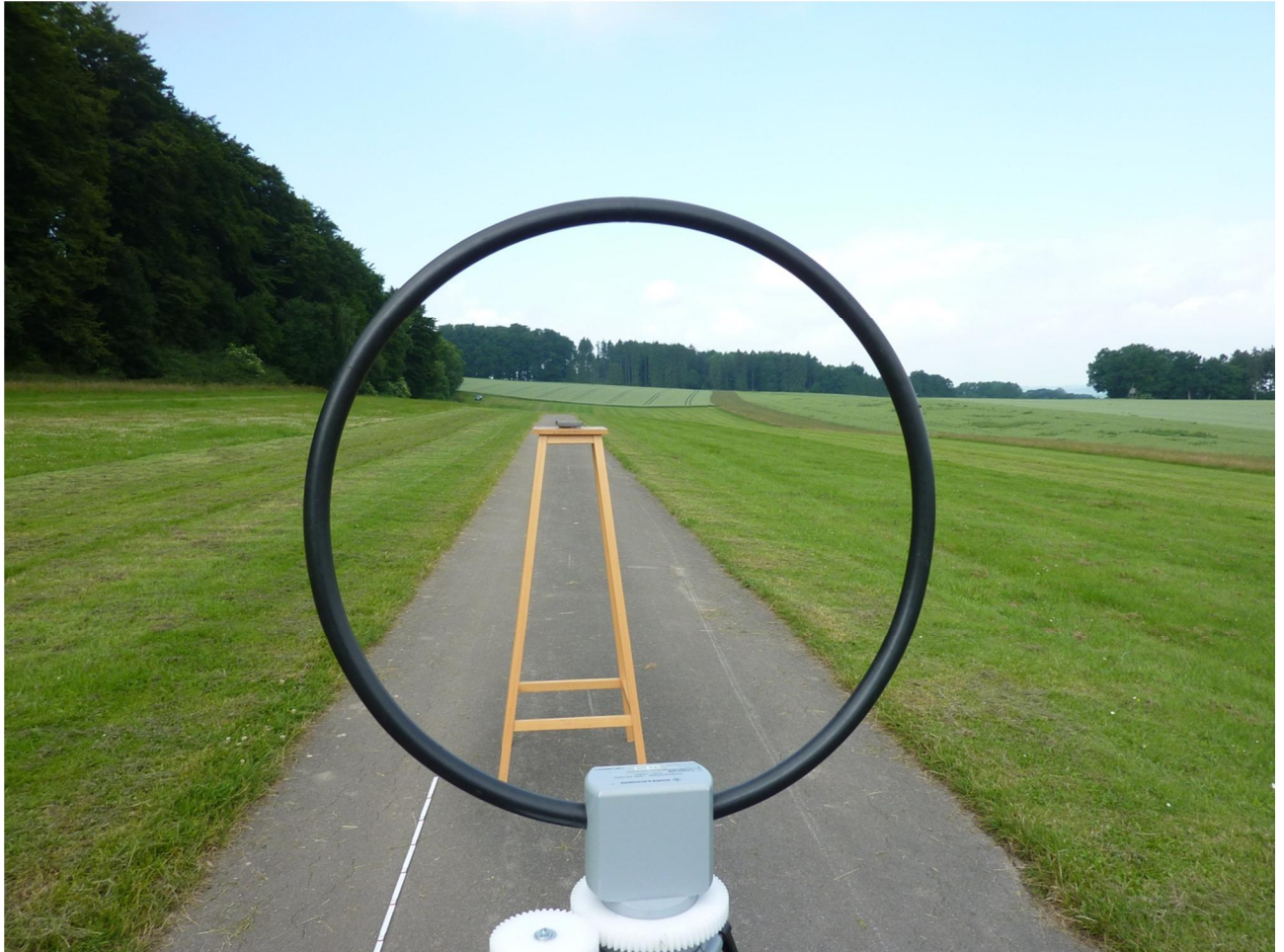
131845emi3.JPG: Test set-up final radiated emission (H-Field)