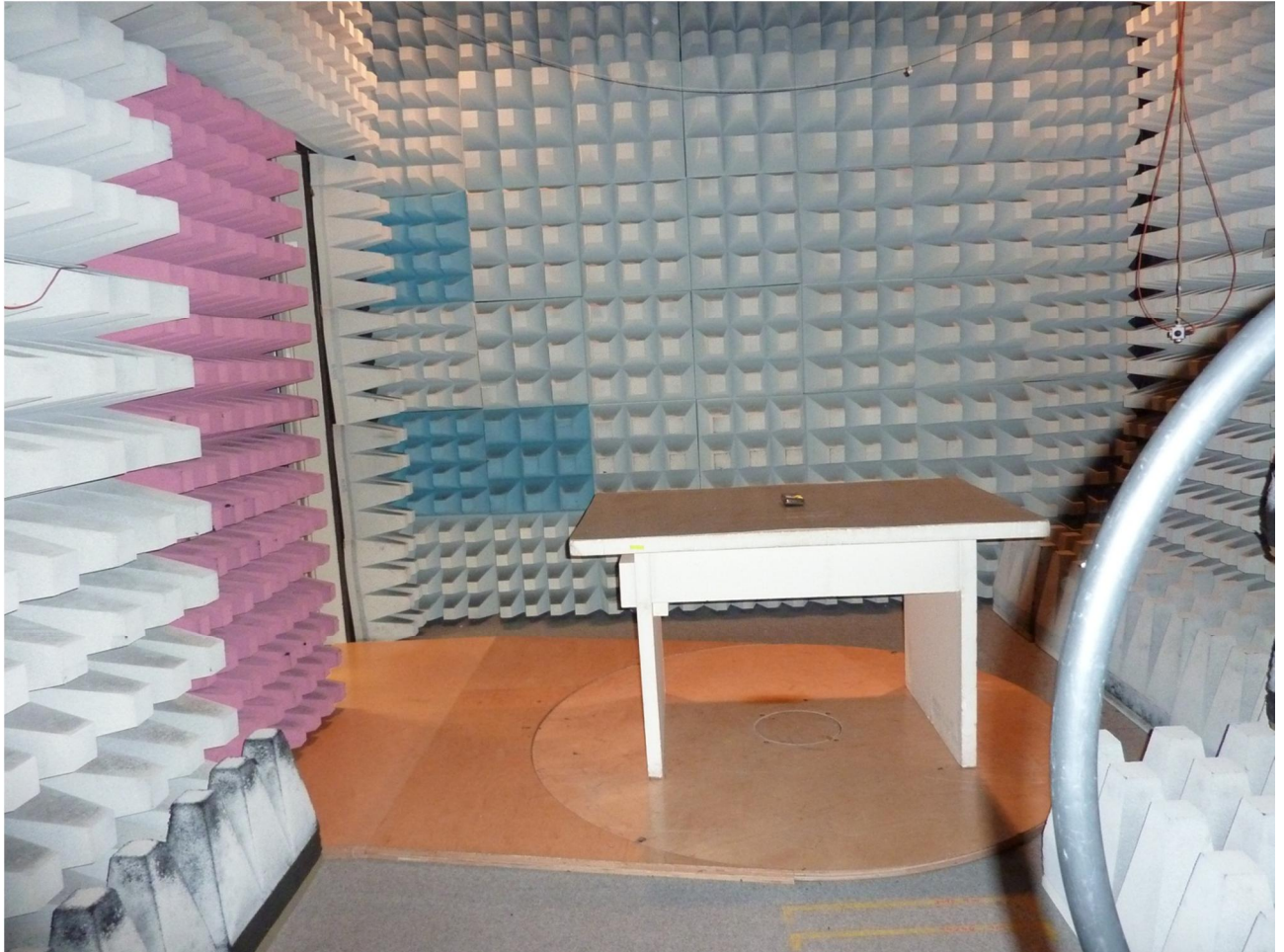
131845emi1.JPG: Test set-up preliminary radiated emission (H-Field)