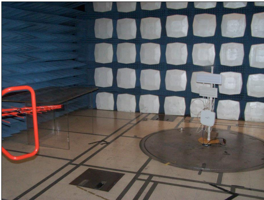
Photograph 2. Radiated Spurious Emissions, Test Setup, 30 MHz – 1 GHz, Panel Antenna