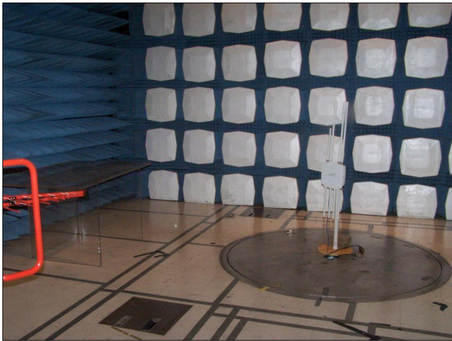
Photograph 4. Radiated Spurious Emissions, Test Setup, 30 MHz – 1 GHz, Omni Antenna