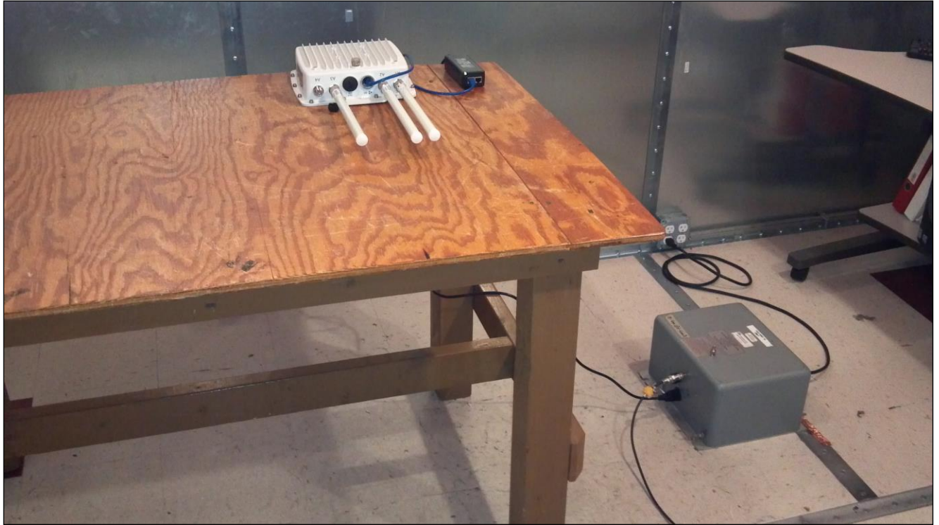
Photograph 1. Conducted Emissions, 15.207(a), Test Setup