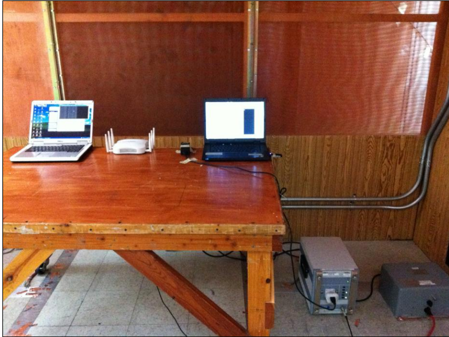
Photograph 3. Conducted Emissions, Test Setup, PoE, 1