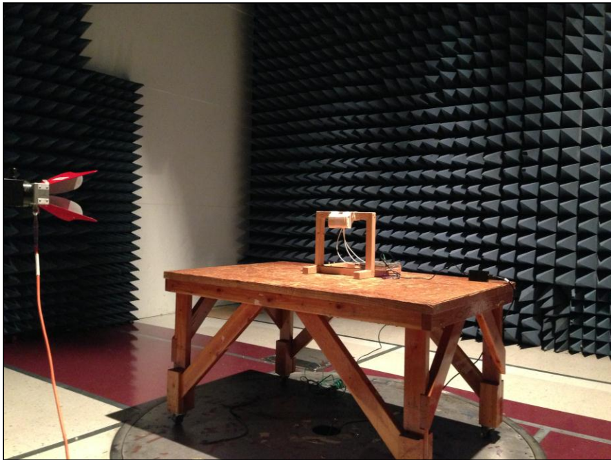
Photograph 10. Radiated Spurious Emissions, Test Setup, Above 1 GHz, Ceiling Antenna