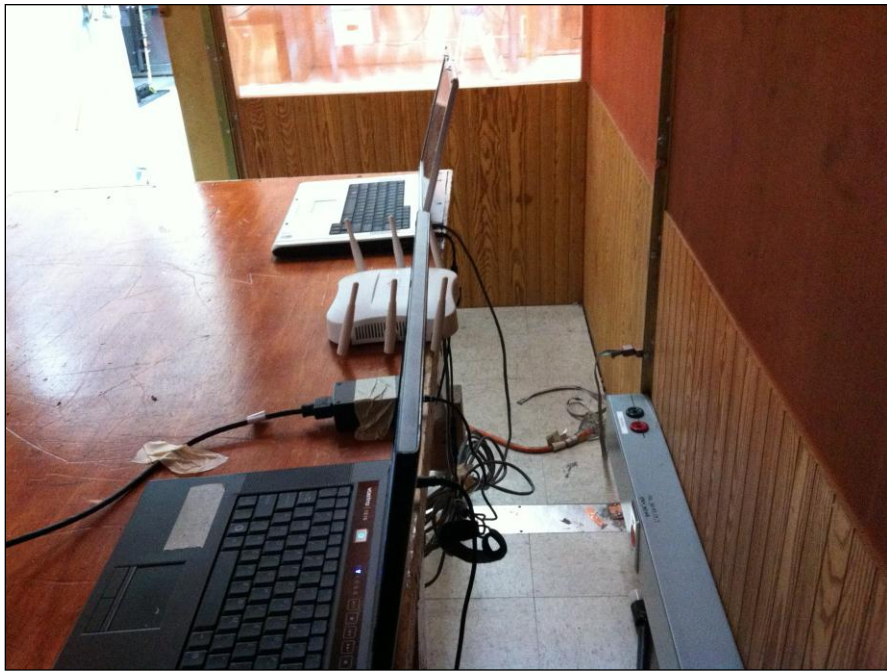
Photograph 2. Conducted Emissions, Test Setup, AC-DC Power Supply, 2