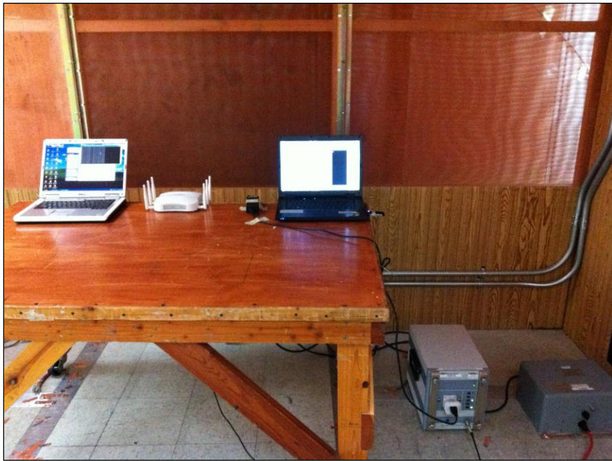
Photograph 8. Conducted Emissions, 15.207(a), Test Setup, PoE