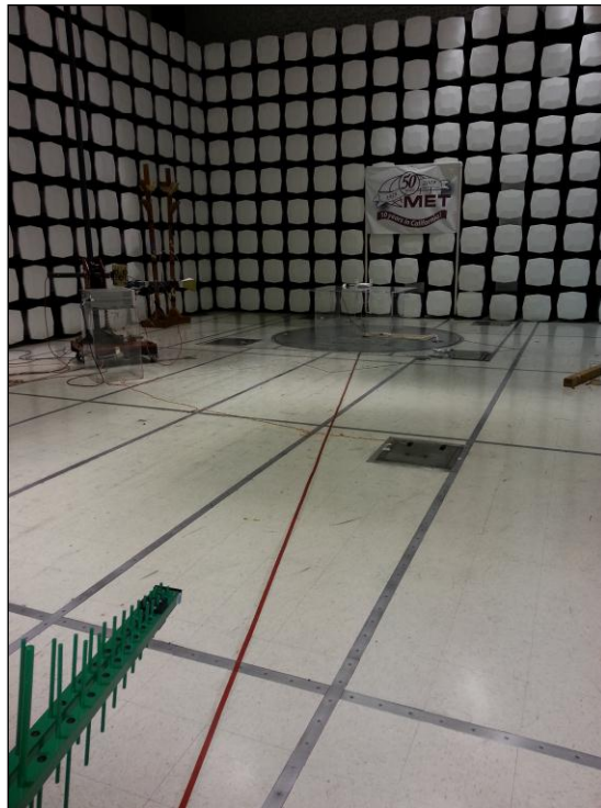
Photograph 6. Radiated Emission, Test Setup, PoE