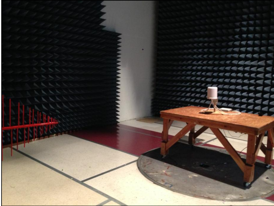
Photograph 11. Radiated Spurious Emissions, Test Setup, 30 MHz – 1 GHz, Omni Antenna