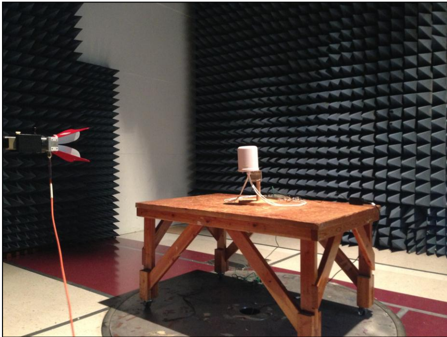
Photograph 12. Radiated Spurious Emissions, Test Setup, Above 1 GHz, Omni Antenna