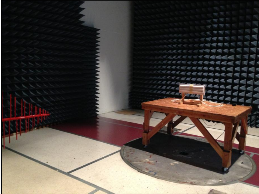
Photograph 13. Radiated Spurious Emissions, Test Setup, 30 MHz – 1 GHz, Patch Antenna