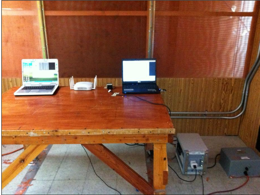
Photograph 7. Conducted Emissions, 15.207(a), Test Setup, AC-DC Power Supply