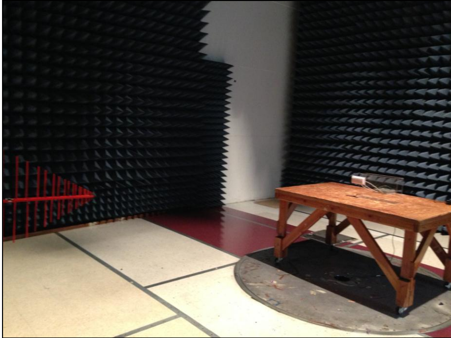
Photograph 9. Radiated Spurious Emissions, Test Setup, 30 MHz – 1 GHz, Ceiling Antenna