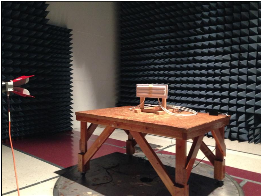
Photograph 14. Radiated Spurious Emissions, Test Setup, Above 1 GHz, Patch Antenna