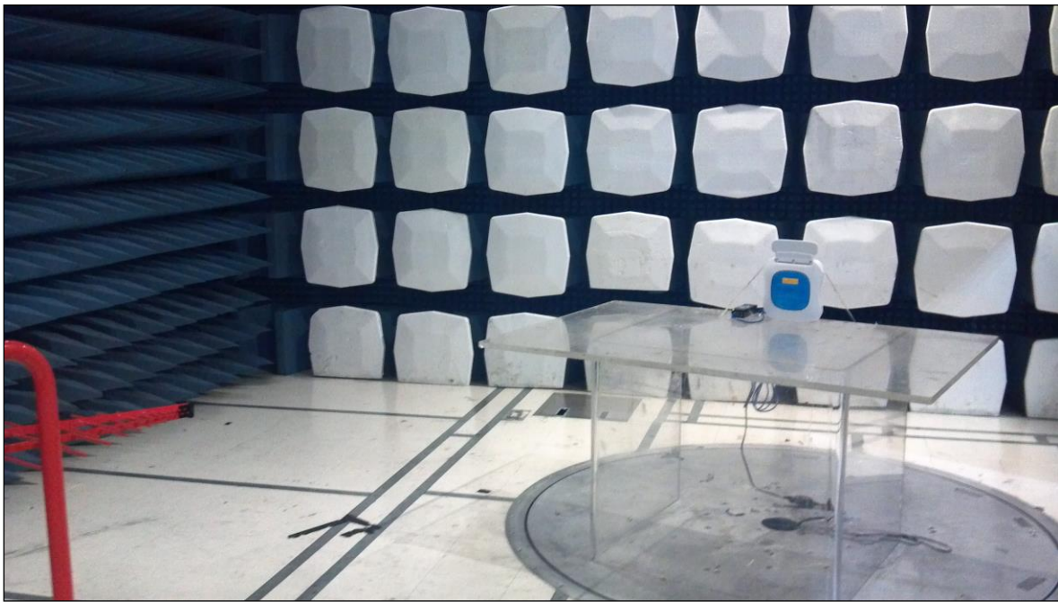
Photograph 2. Radiated Spurious Emissions, Test Setup, 30 MHz – 1 GHz