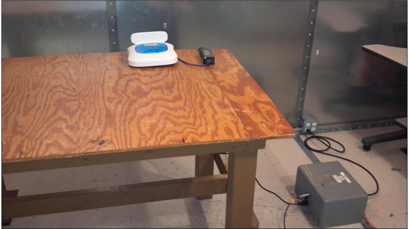
Photograph 1. Conducted Emissions, 15.207(a), Test Setup