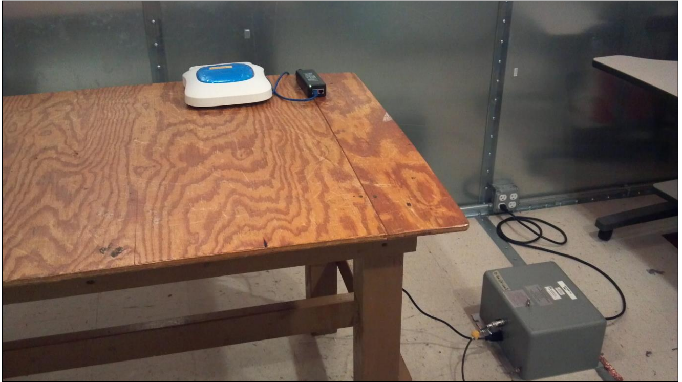
Photograph 1. Conducted Emissions, 15.207(a), Test Setup