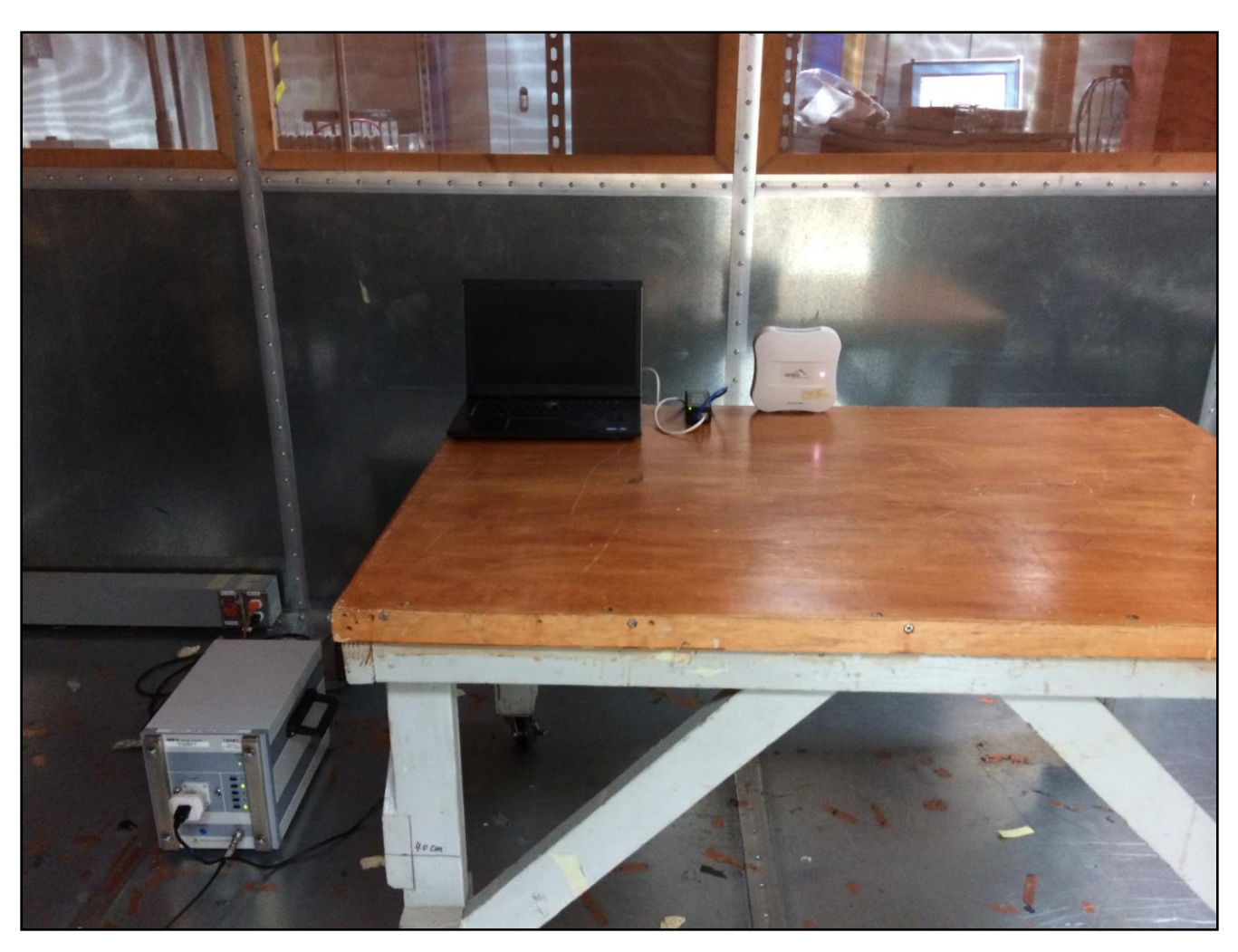
Photograph 1. Conducted Emissions, 15.207(a), Test Setup