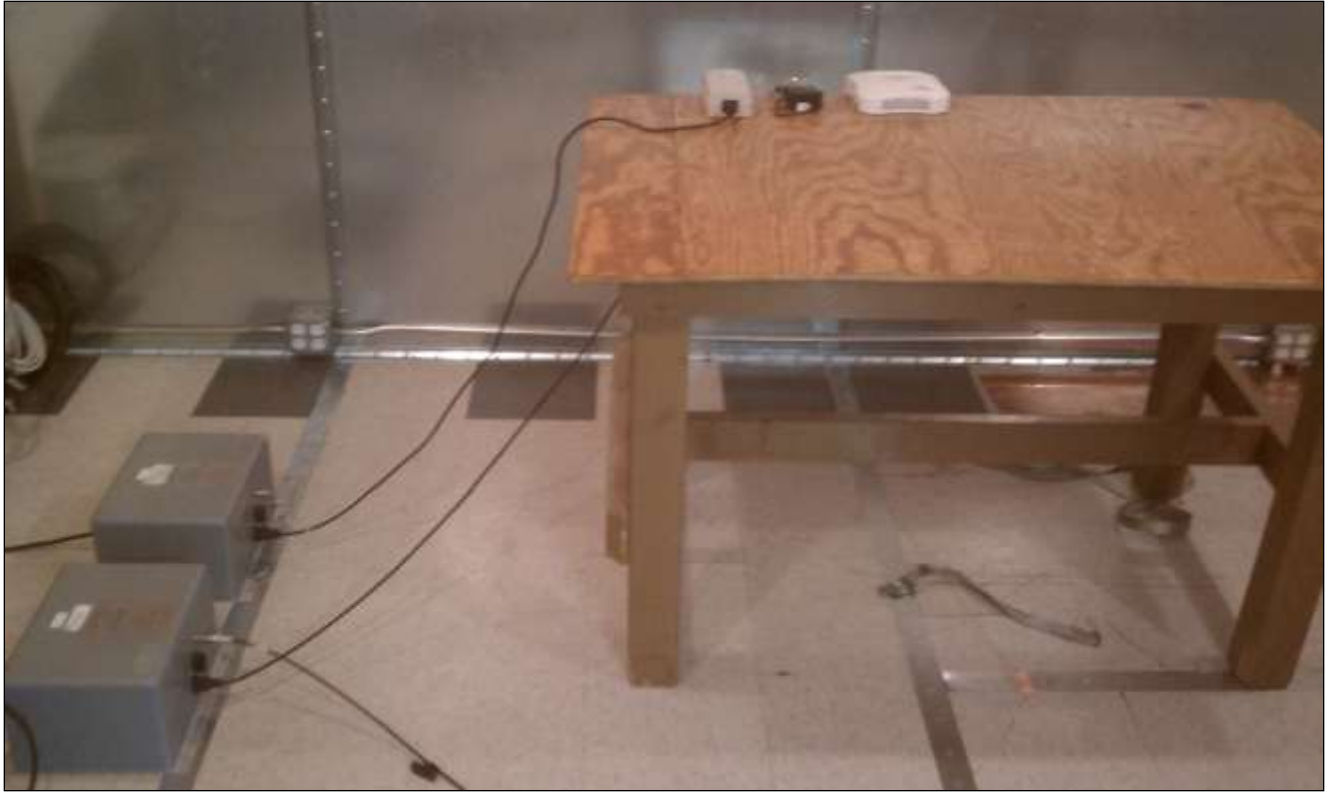
Photograph 1. Conducted Emissions, Test Setup