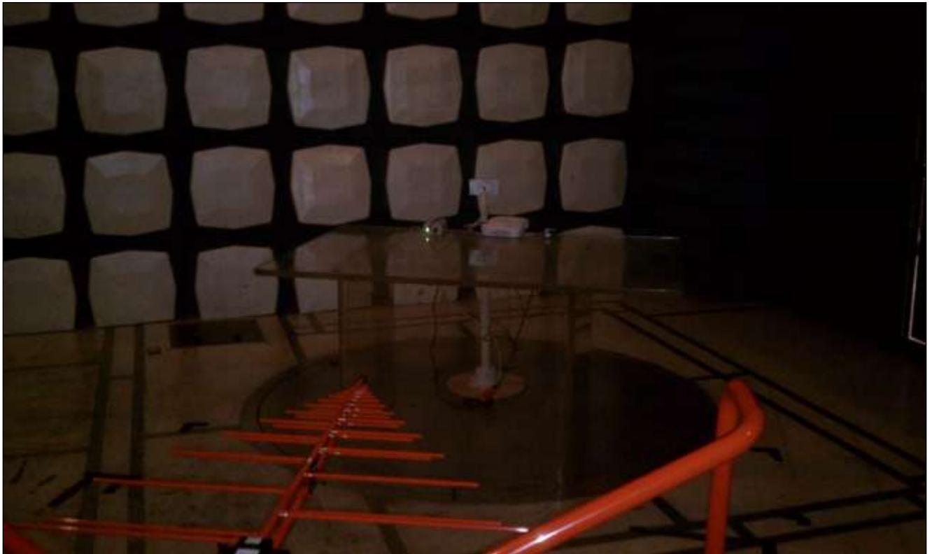
Photograph 2. Radiated Emission, Test Setup