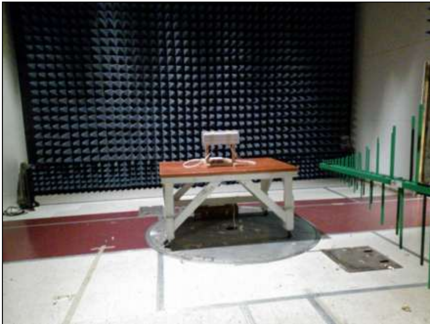
Photograph 6. Radiated Spurious Emissions, Test Setup, 6 dBi Patch, 30 MHz – 1 GHz