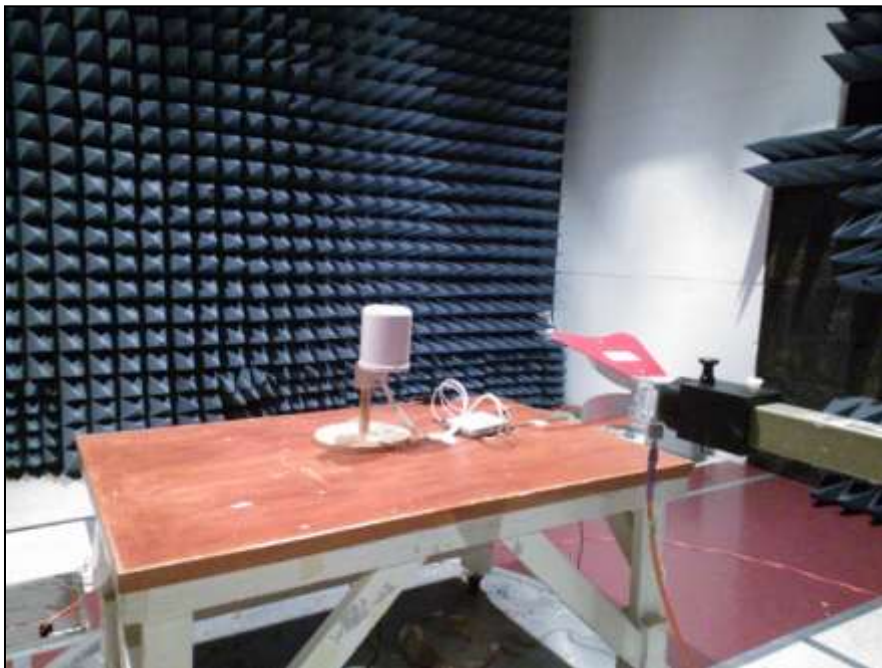
Photograph 8. Radiated Spurious Emissions, Test Setup, 6 dBi Omni, 1m