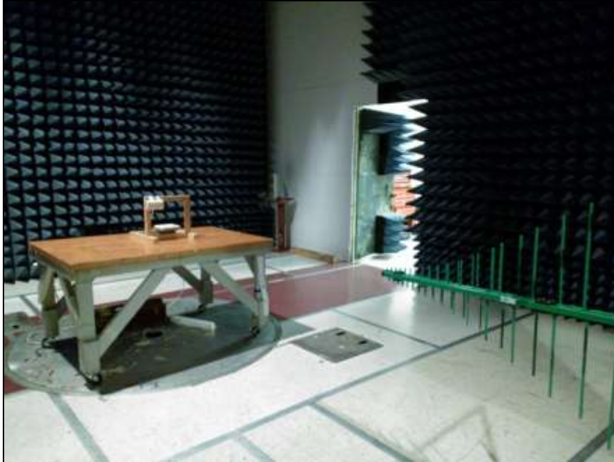
Photograph 7. Radiated Spurious Emissions, Test Setup, 3 dBi Ceiling Mount Omni, 30 MHz – 1 GHz