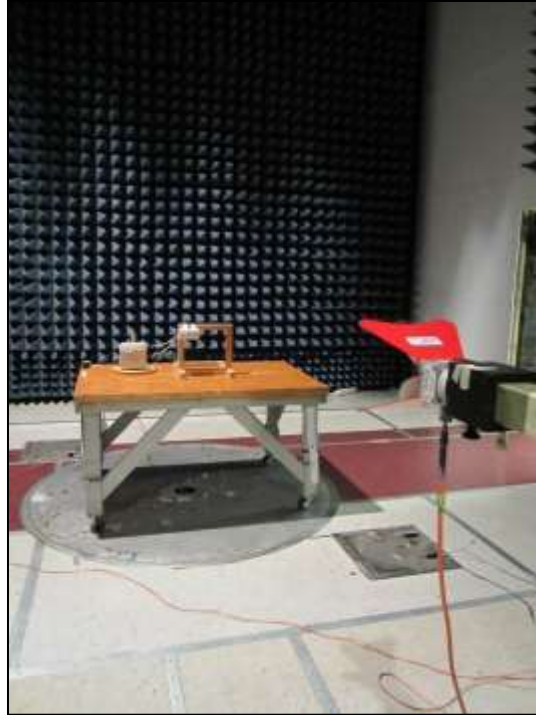
Photograph 13. Radiated Band Edge, Test Setup, Ceiling Mount Omni Antenna, 3m