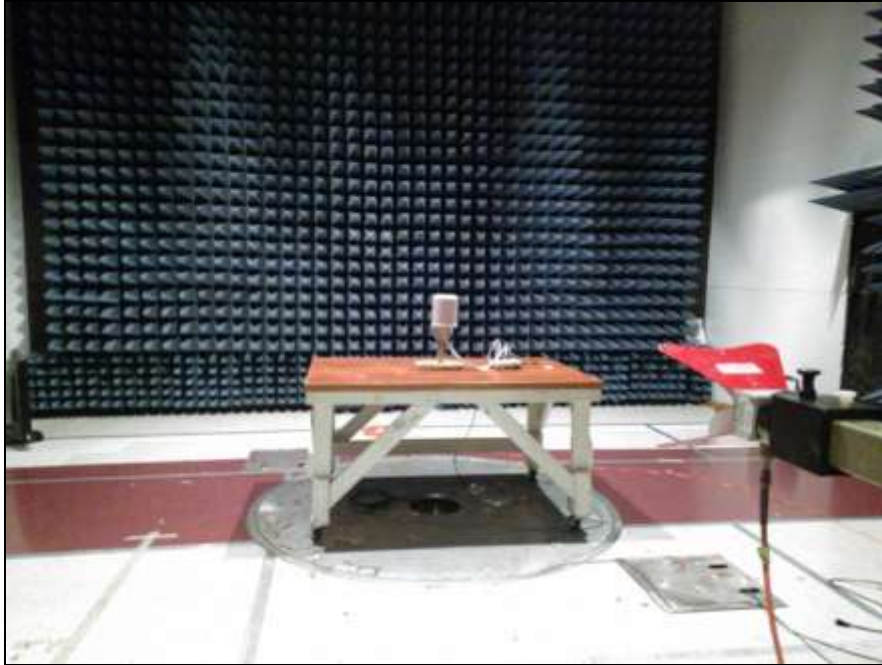
Photograph 11. Radiated Band Edge, Test Setup, Omni Antenna, 3m