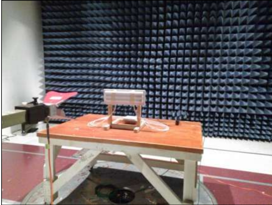
Photograph 9. Radiated Spurious Emissions, Test Setup, Patch Antenna, 1m