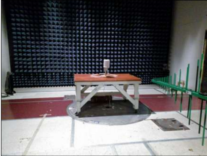
Photograph 5. Radiated Spurious Emissions, Test Setup, 6 dBi Omni, 30 MHz – 1 GHz