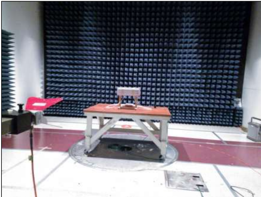
Photograph 12. Radiated Band Edge, Test Setup, Patch Antenna, 3m