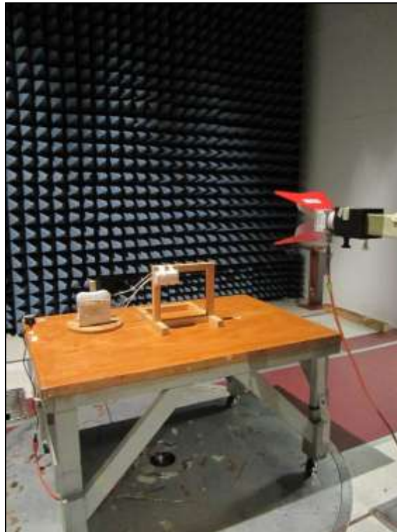
Photograph 10. Radiated Spurious Emissions, Test Setup, Ceiling Mount Omni Antenna