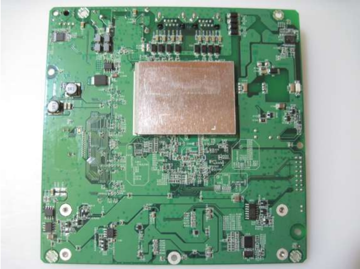
Photograph 3. Board Back