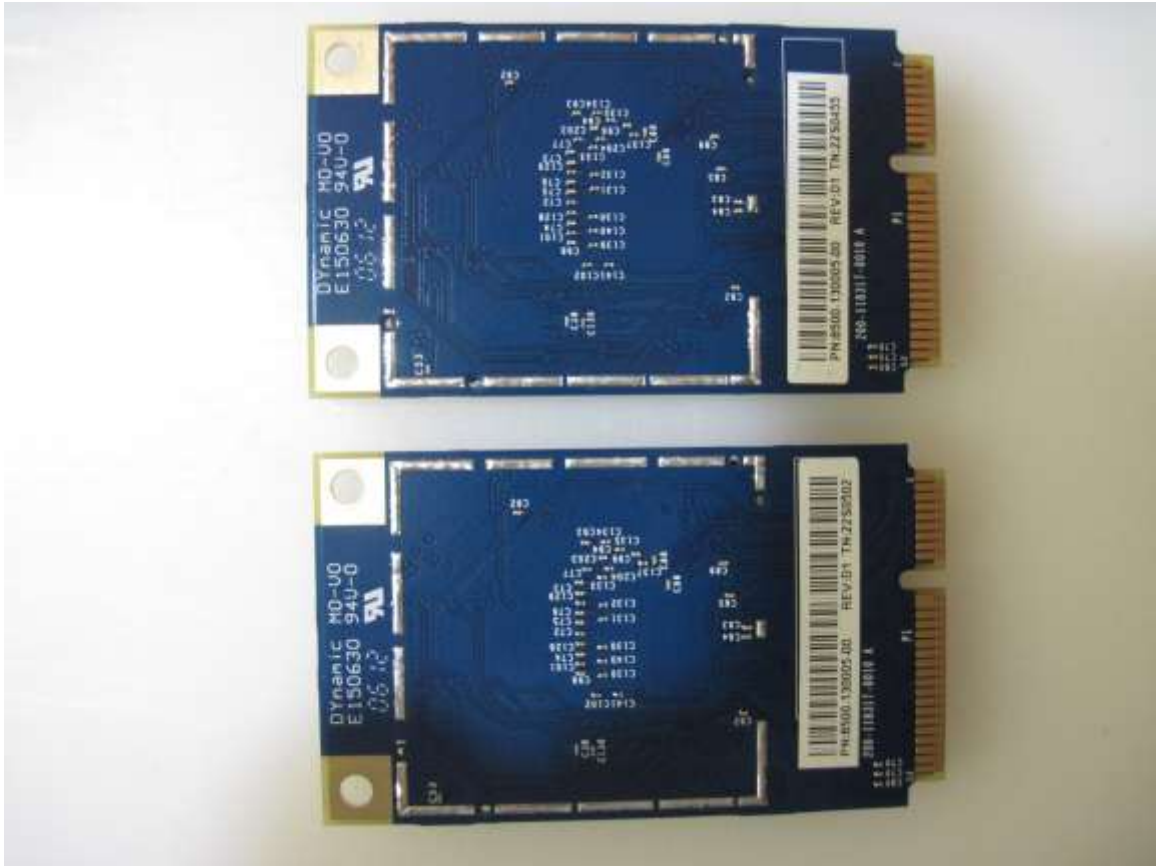
Photograph 8. RF Cards Back