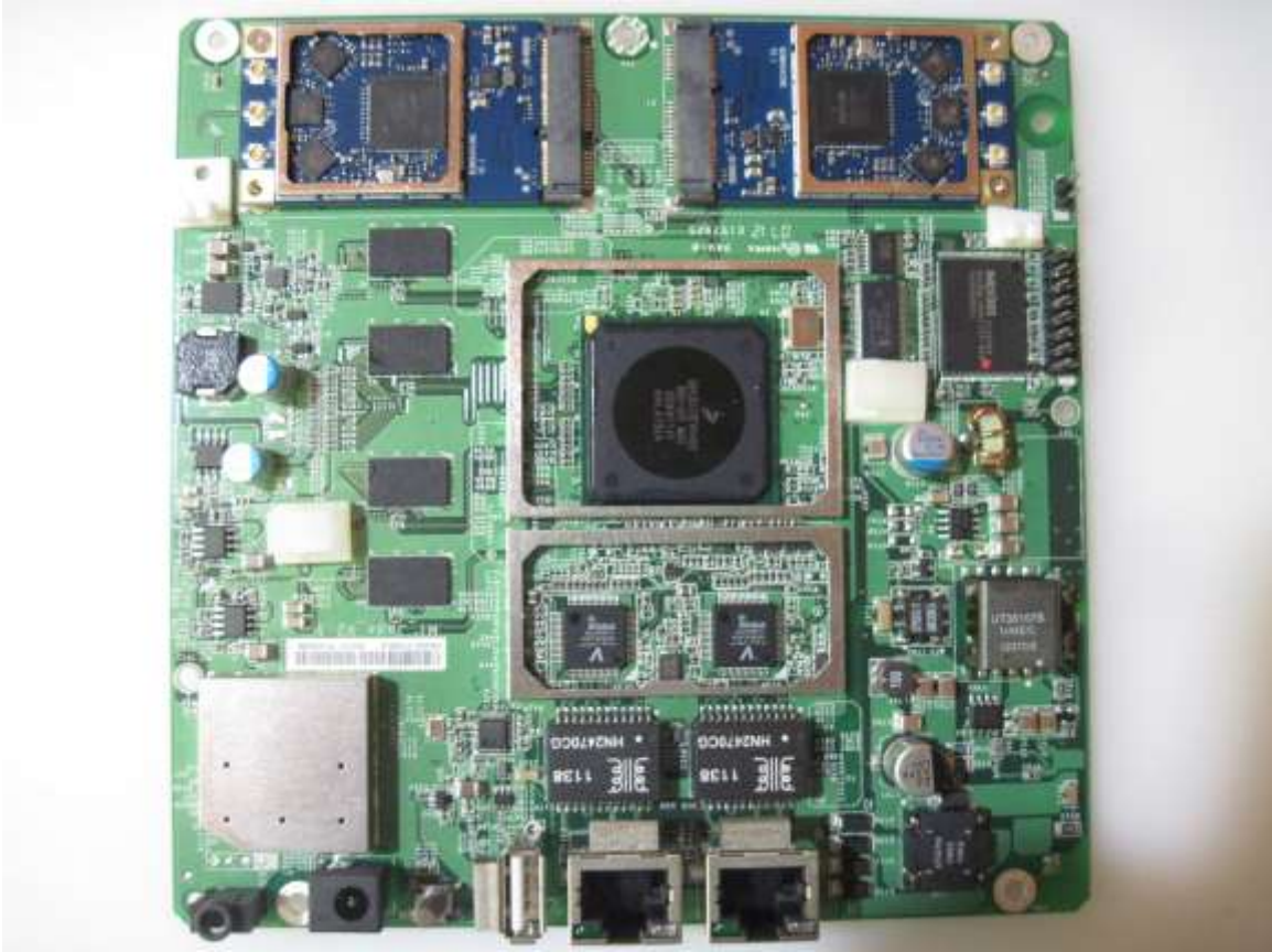
Photograph 4. Board Top