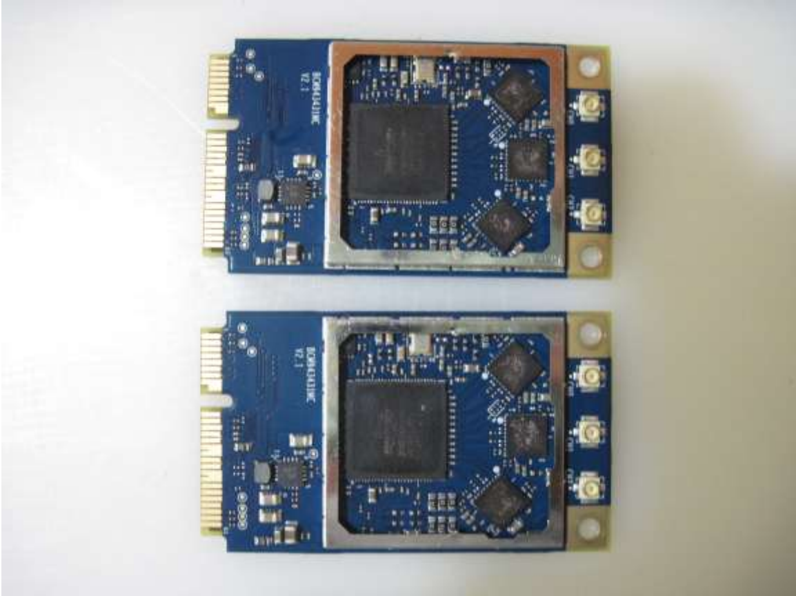
Photograph 9. RF Cards Front