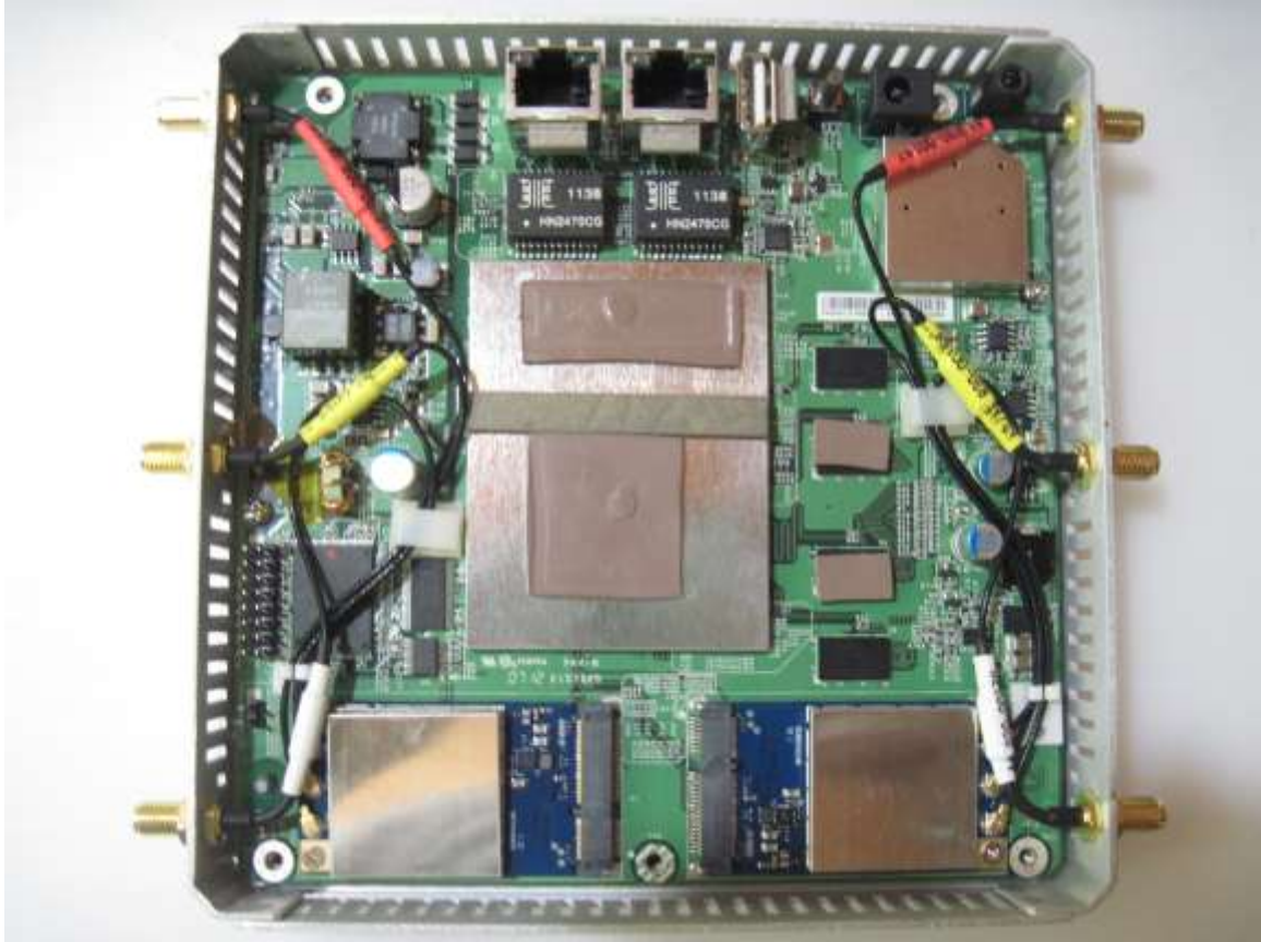
Photograph 6. Cover Off 2