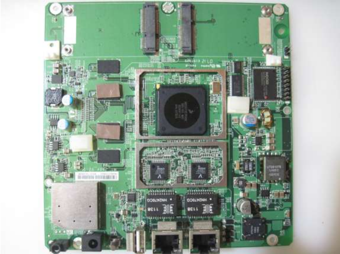
Photograph 5. Cans Removed