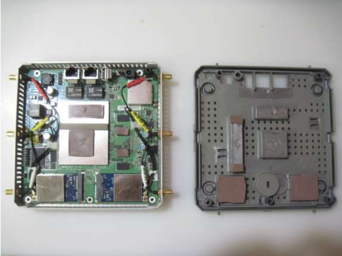
Photograph 7. Cover Off