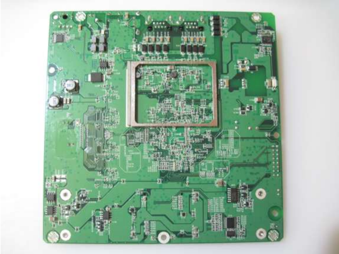
Photograph 1. Board Back with Can removed