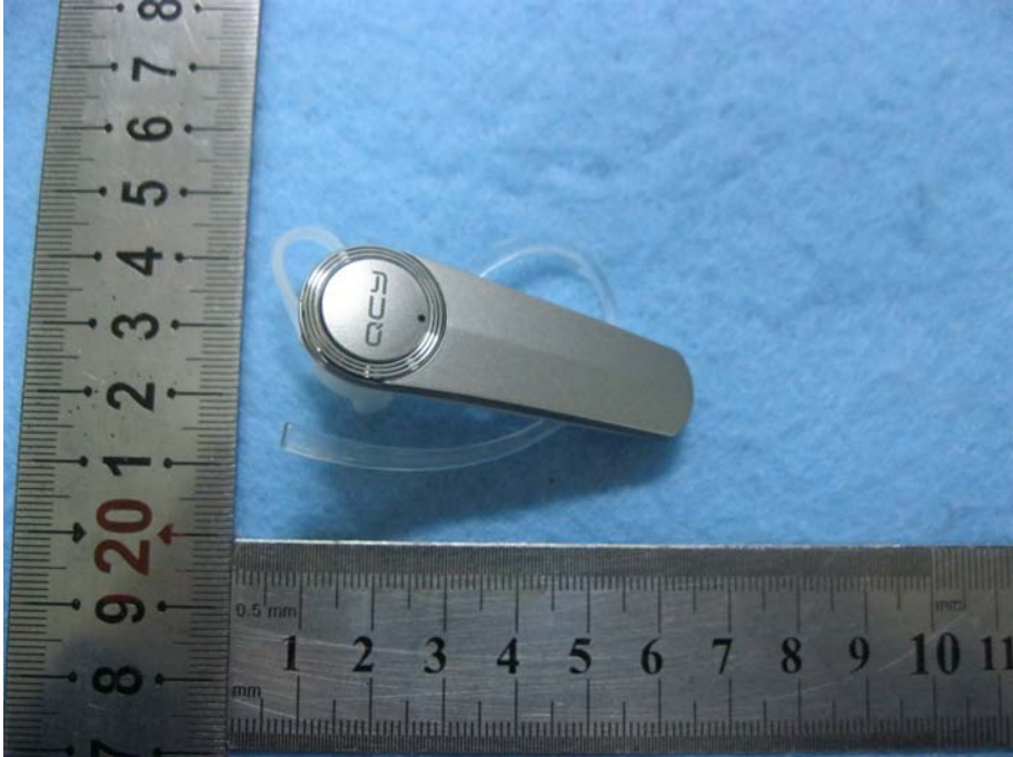
EUT View 11 (Iron Grey)