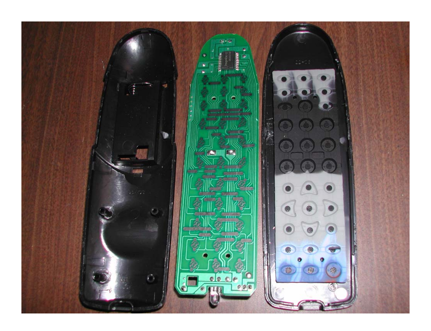
FIGURE 7: PLI Photograph Number 5392C2633SJ-15 illustrates the disassembled remote control and the circuit side of the remote control printed circuit assembly (assembly number S-251G203).

PLI Evaluation Report (RFI) TITLE: FCCID: RDL5392X Page 31 of 47 Issued: 11 Sep 2003 DRAWING: Q539205FCCW.DWG Lee Pulver and Phuong Nguyen BY: Approved: Lee Pulver