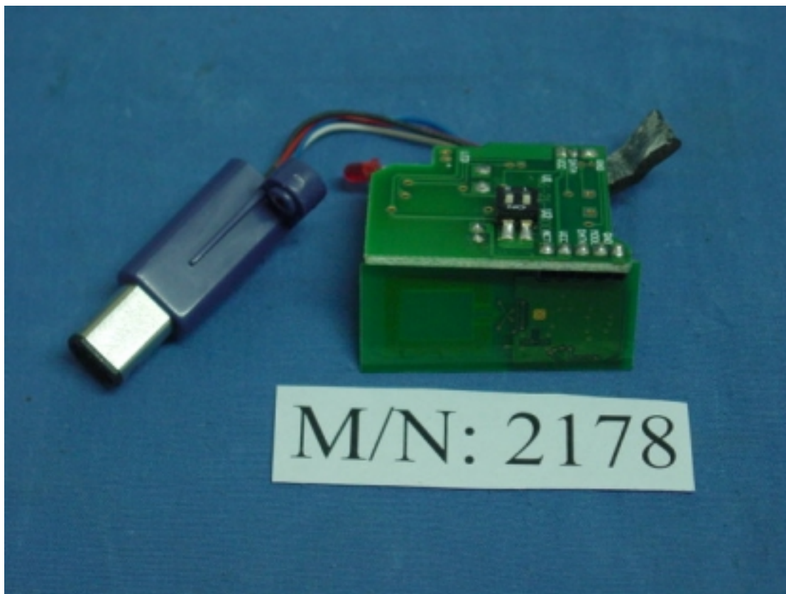
Figure 7 Main Board, Component Side