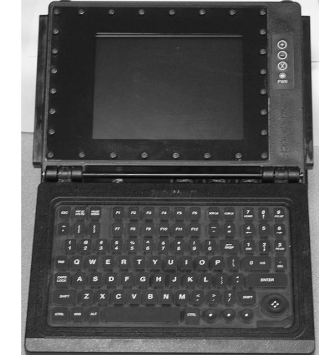
14.3.4 V2 Computer (Screen and Keyboard)