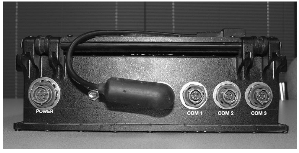
14.3.5 V2 MIL Ports