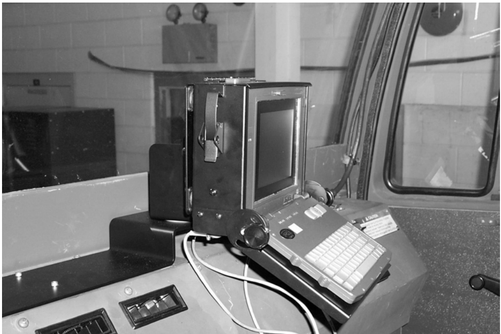
Figure 14-1 V2 computer mount (with V2 Computer installed) inside FMTV cab