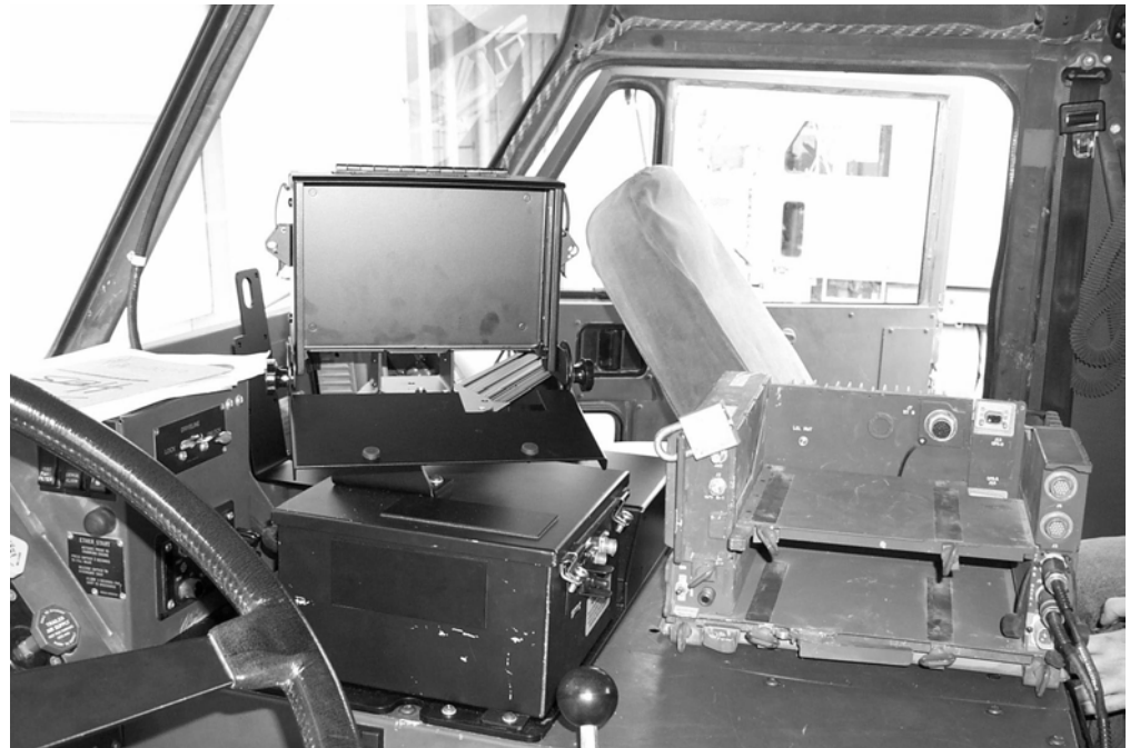
Figure 14-4 V2 computer mount (without V2 Computer installed) inside HET cab

Figure 14-3 V2 computer mount (without V2 Computer) inside HEMTT cab 14.1.4 HET