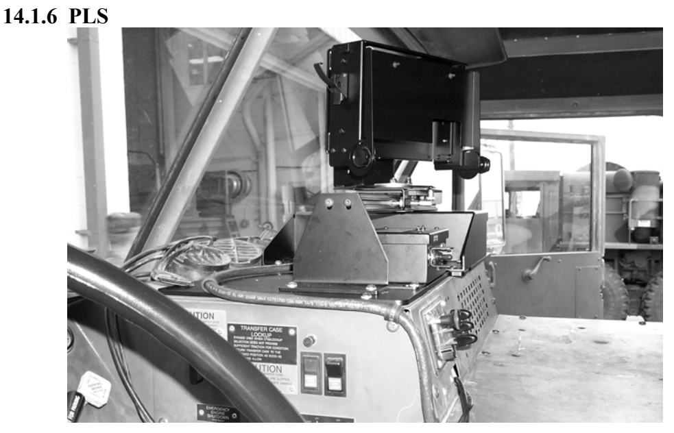
Figure 14-6 V2 Computer Mount (without V2 Computer installed) inside PLS Notice the control panel under the sliding computer mount.

Notice the Control Box in the center of the cab and the PLGR mounted next to the V2 computer.