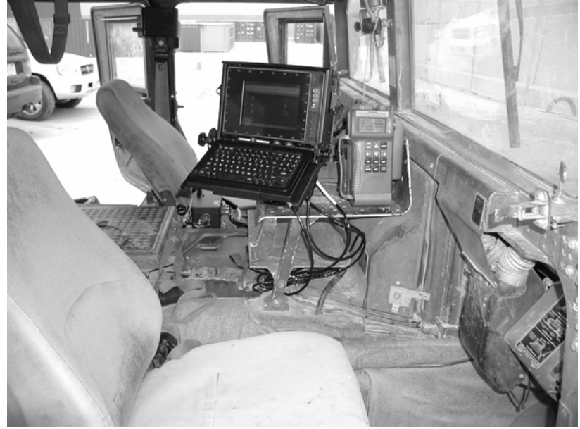
Figure 14-5 V2 Computer Mount inside HMMWV

Notice the Control Box in the center of the cab and the PLGR mounted next to the V2 computer.