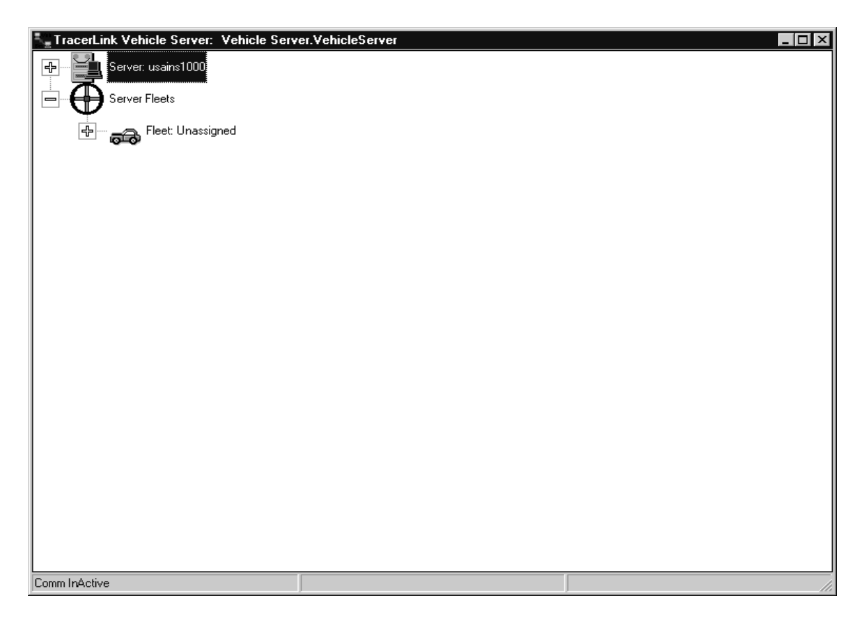
Figure 9-4 Vehicle Server Window – COMM InActive