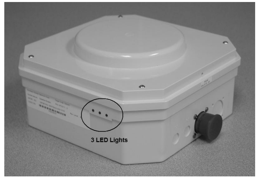
Figure 9-3 LEDs on Transceiver

The transceiver is equipped with three colored LEDs (light emitting diodes). The LEDs are colored Red, Yellow and Green. The LEDs are located on the side of the MT-2011 (shown in Figure 9-3) and MT-2010 terminals.