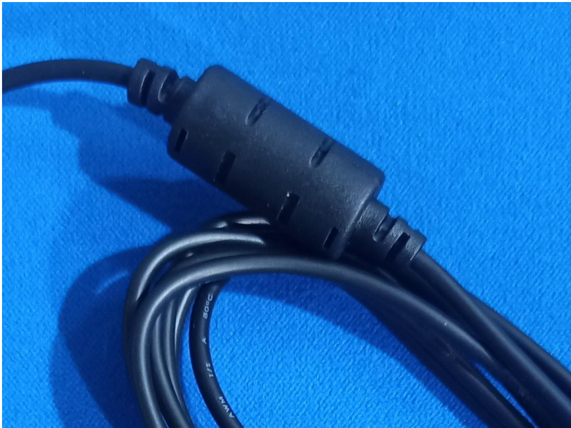
Power cord (US)

Brand: I-SHENG / Model: V44VS336T1218000-A01