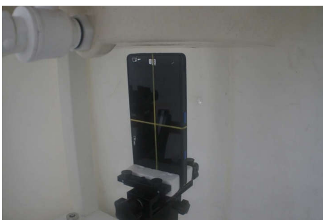
Bottom Side, Test Separation 10 mm