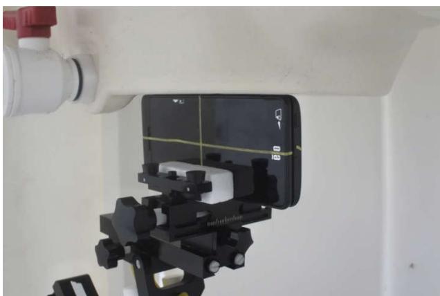
Right Side, Test Separation 0 mm