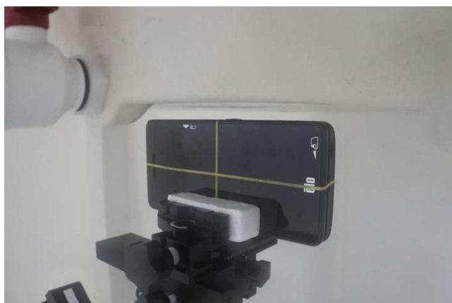
Right Side, Test Separation 10 mm