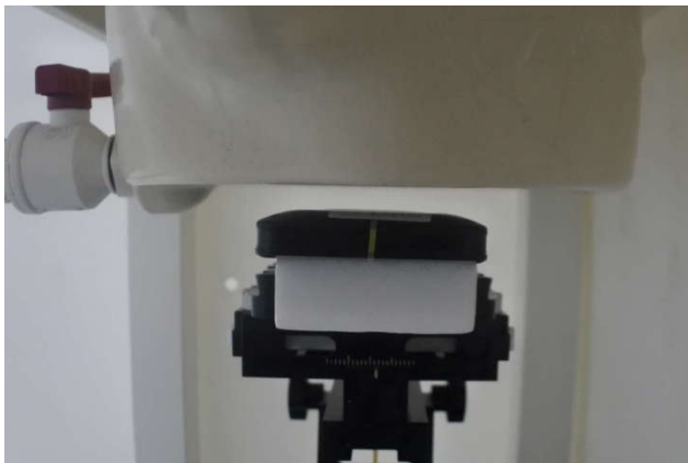
Back, Test Separation 13 mm