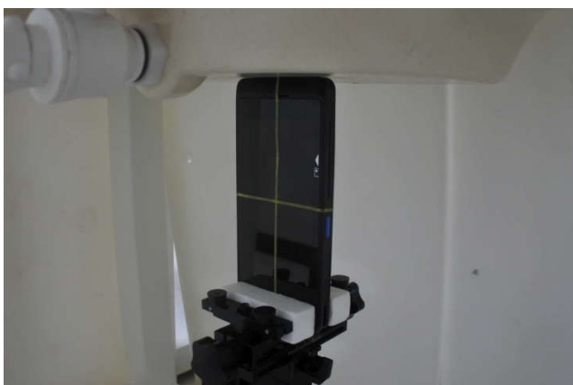
Top Side, Test Separation 0 mm