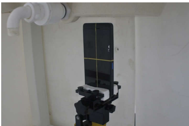
Top Side, Test Separation 12 mm