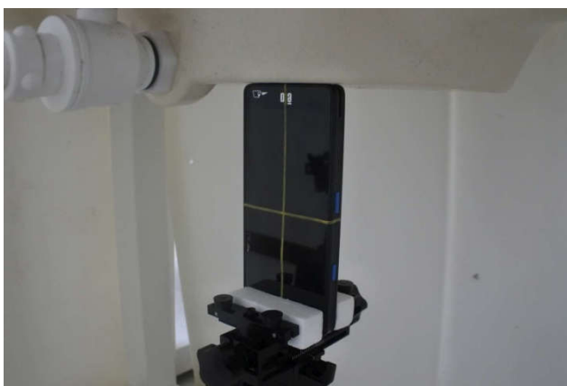
Bottom Side, Test Separation 0 mm