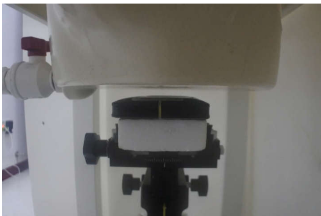
Back, Test Separation 10 mm