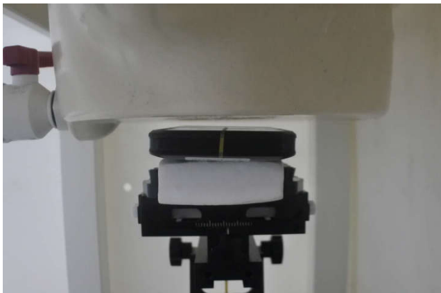
Front, Test Separation 5 mm