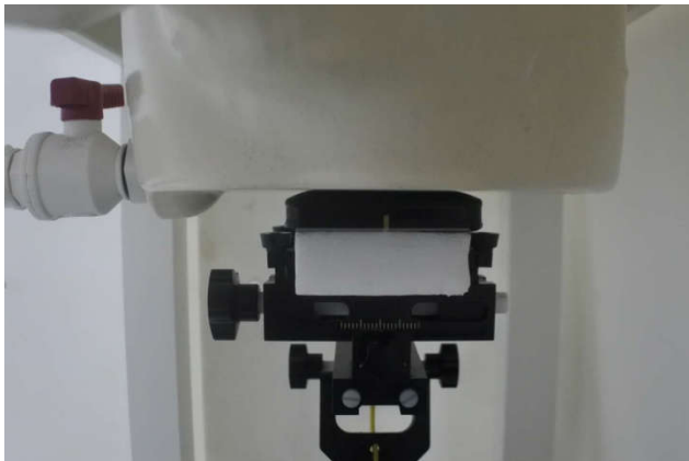
Back, Test Separation 0 mm