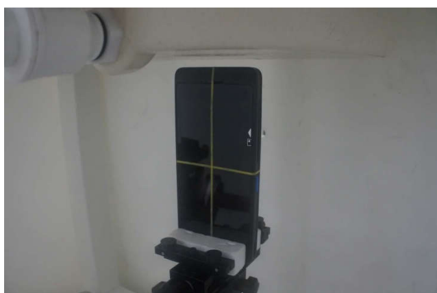
Top Side, Test Separation 10 mm