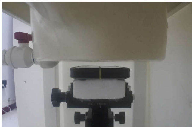
Front, Test Separation 10 mm