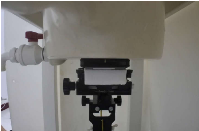
Front, Test Separation 0 mm