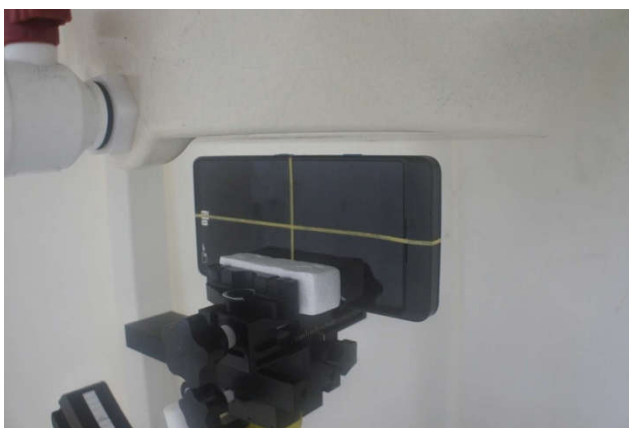
Left Side, Test Separation 10 mm