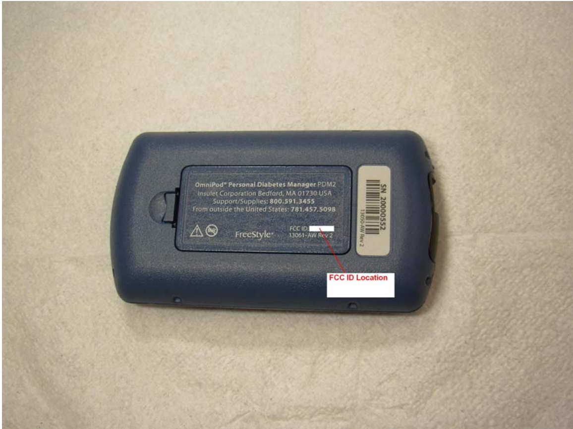
Back with FCC ID