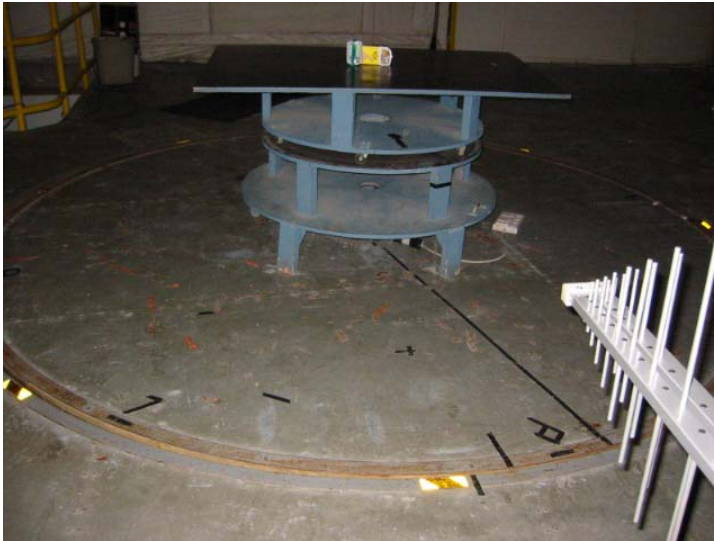
Spurious Test Setup, Front View