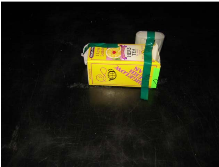
Spurious Test Setup, Back View