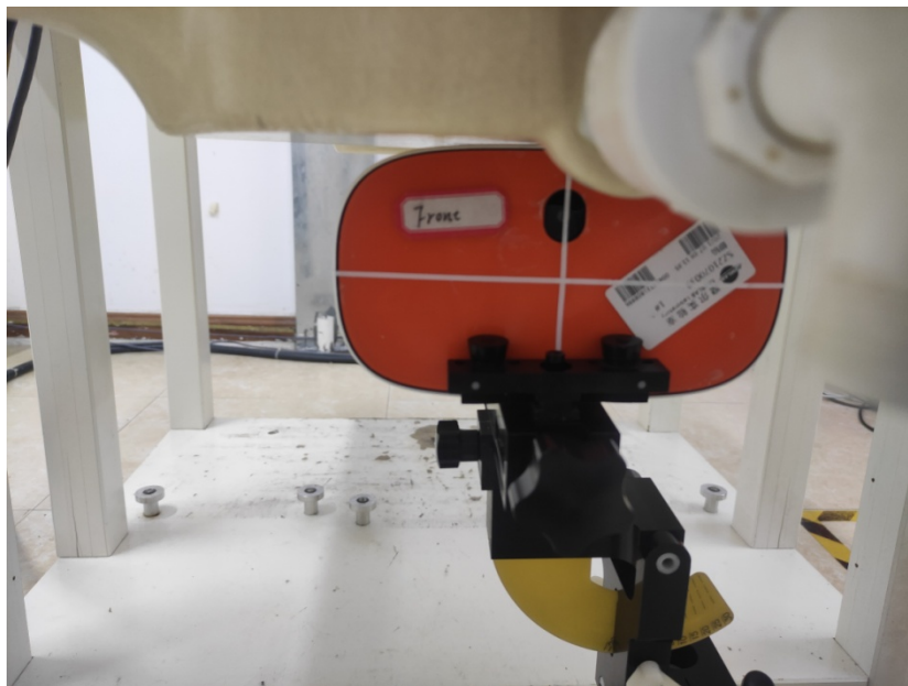
Bottom Side (Test distance: 0mm)