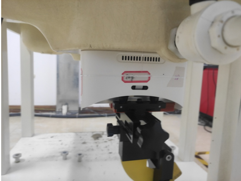
Front Side (Test distance: 0mm)