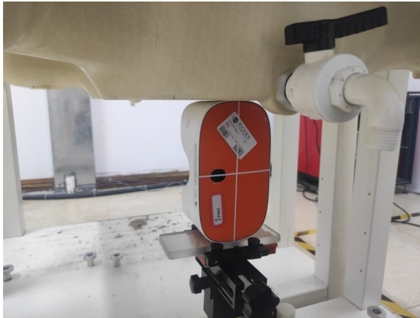
Left Side (Test distance: 0mm)