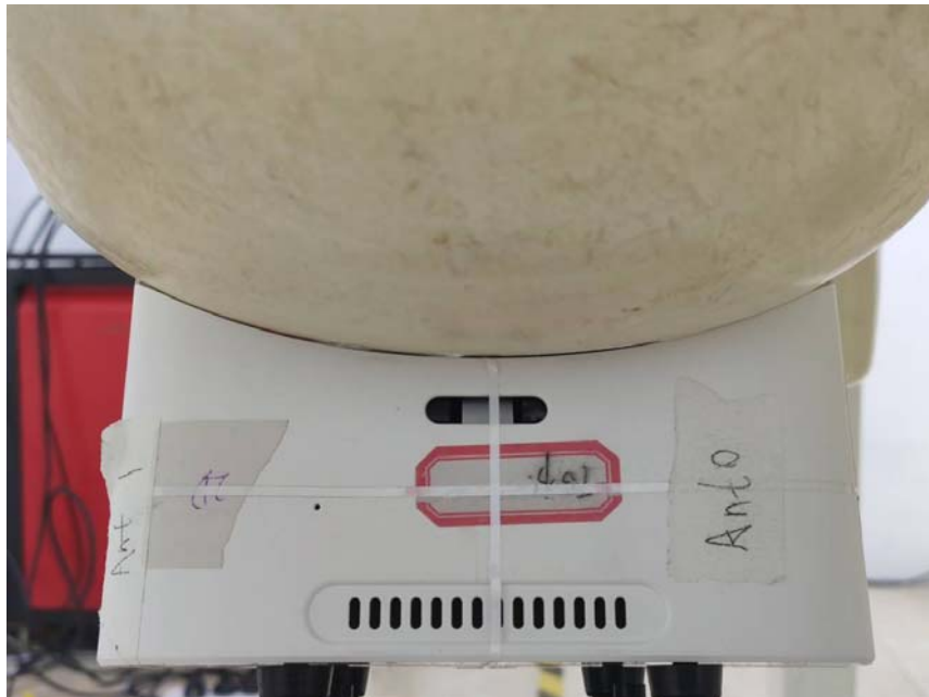
Next to face (Test distance: 0mm)