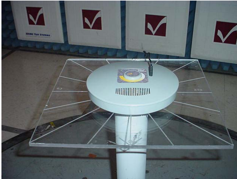
View of the EUT during Radiated Emission Testing in the 3 Meter FCC Listed Chamber