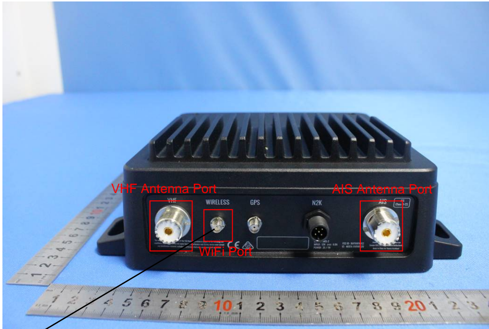
RP SMA Connector