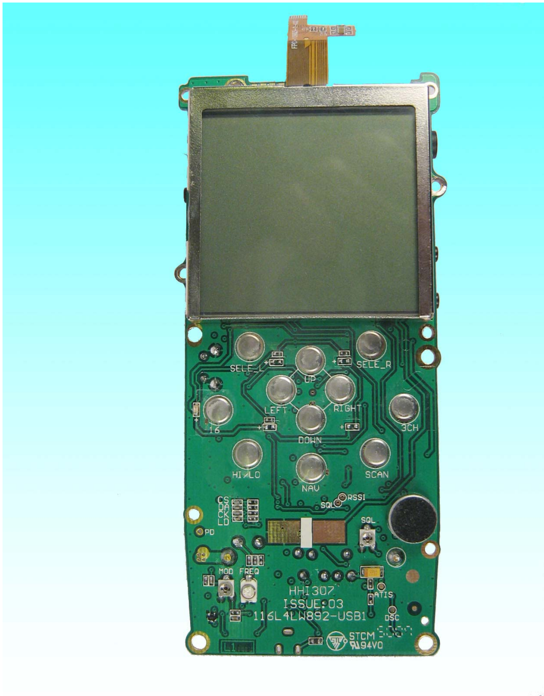
Main Board Top View 1