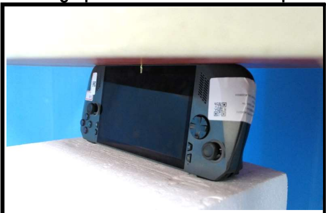
Bottom Side of EUT Tested at 0 mm