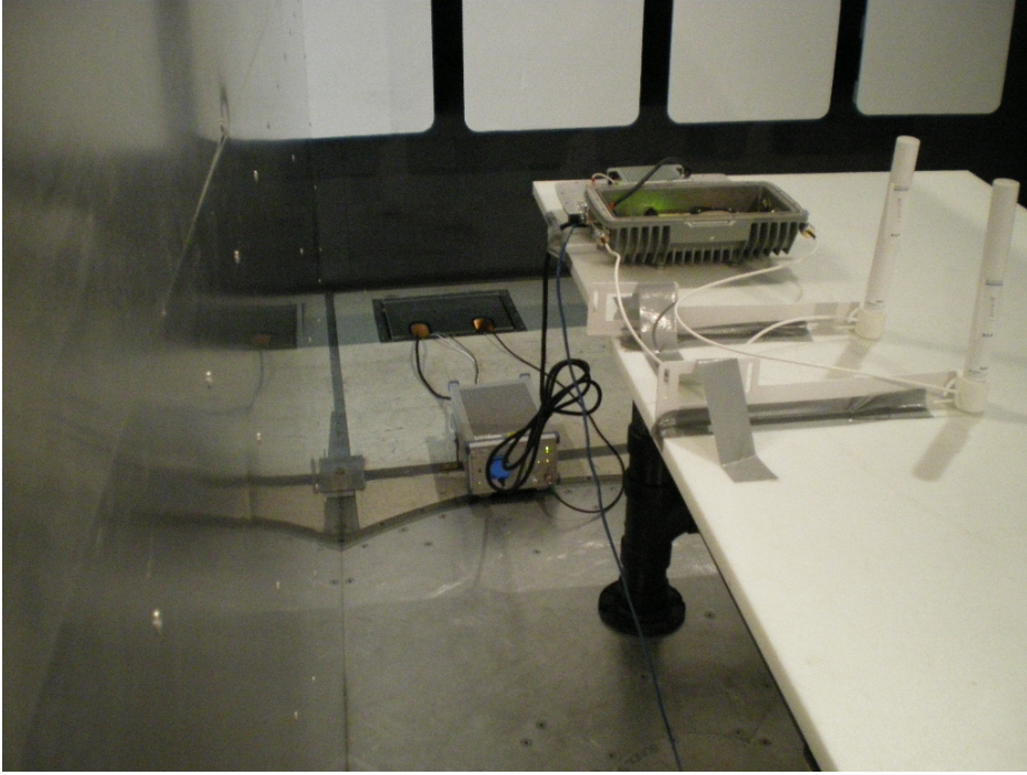
AC Power Line Conducted Emissions