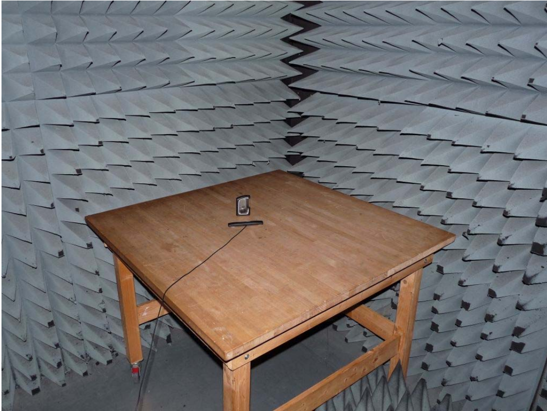
Photo 1: Test setup for radiated measurements (Enclosure, below 30 MHz)