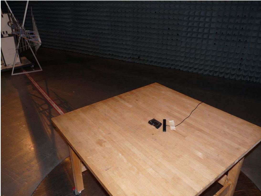
Photo 2: Test setup for radiated measurements (Enclosure, 30 MHz to 1 GHz)