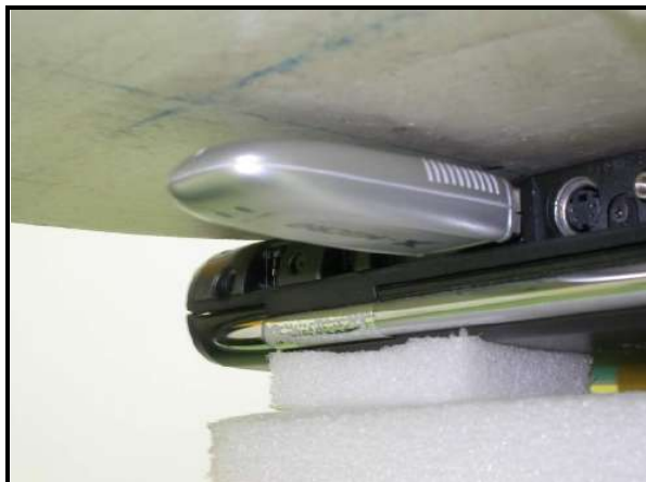
A: NOTEBOOK MODEL: N800C

The following test configurations have been applied in this test report: