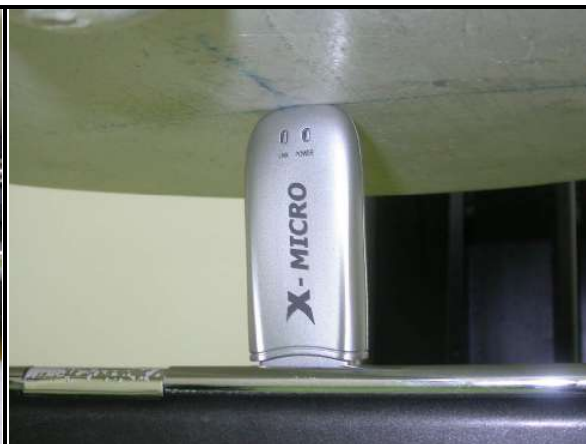
B: NOTEBOOK MODEL: N800C

The bottom of the EUT faces to the phantom with 6mm-separation distance.