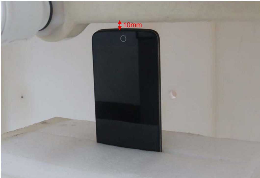
Picture 21: Bottom Side, the distance from handset to the bottom of the Phantom is 10mm