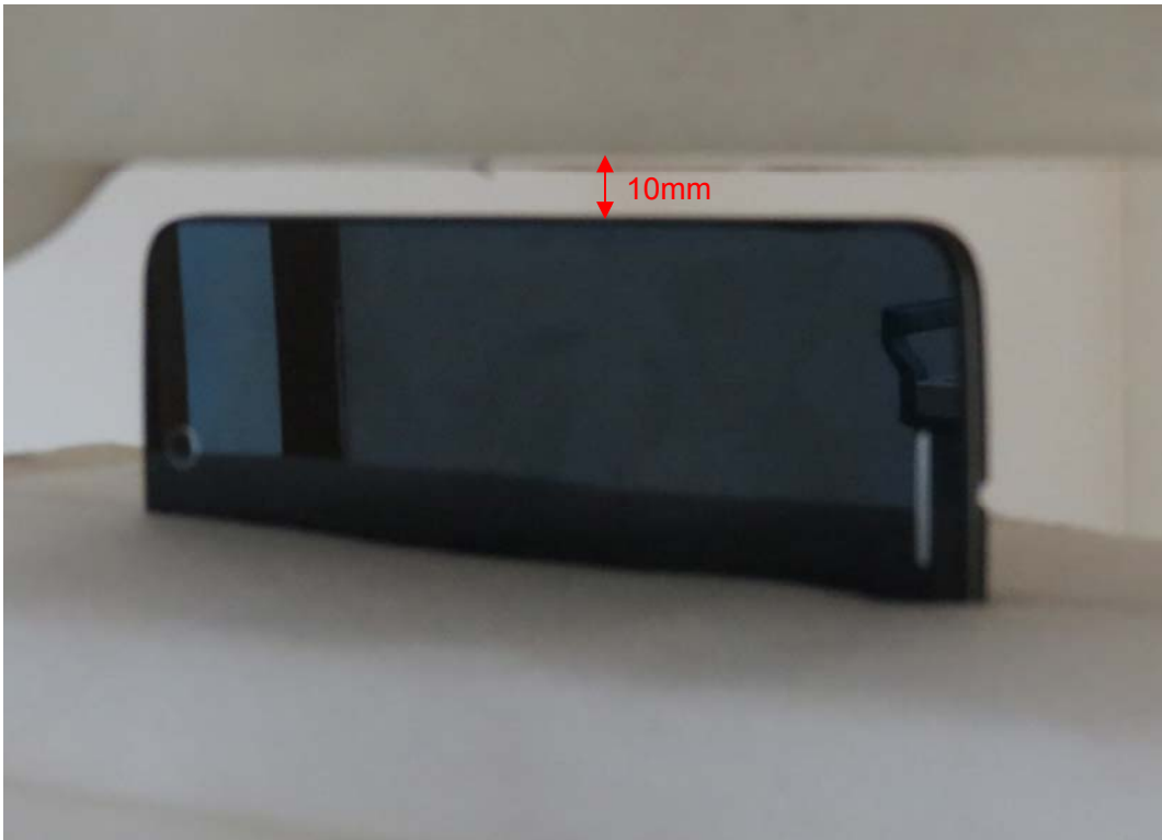
Picture 18: Left Side, the distance from handset to the bottom of the Phantom is 10mm