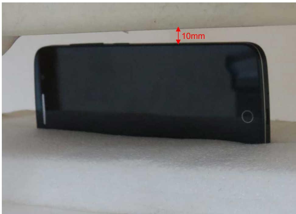
Picture 19: Right Side, the distance from handset to the bottom of the Phantom is 10mm