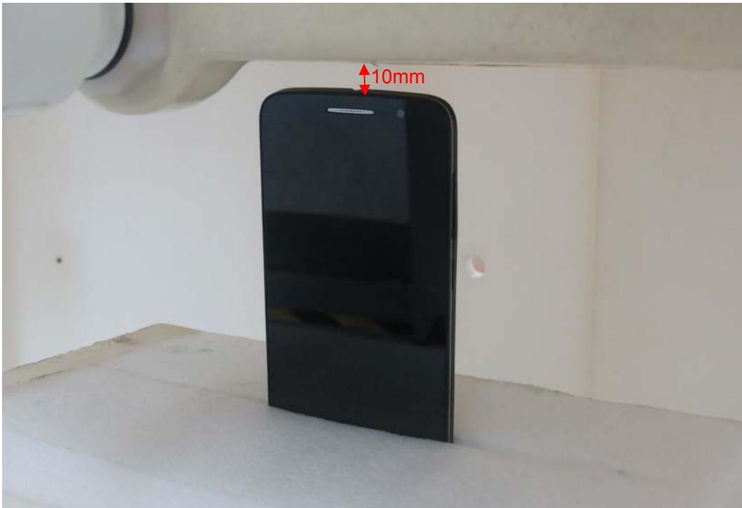
Picture 20: Top Side, the distance from handset to the bottom of the Phantom is 10mm