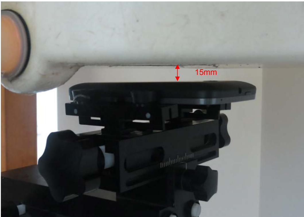
Picture 17: Back Side, the distance from handset to the bottom of the Phantom is 15mm