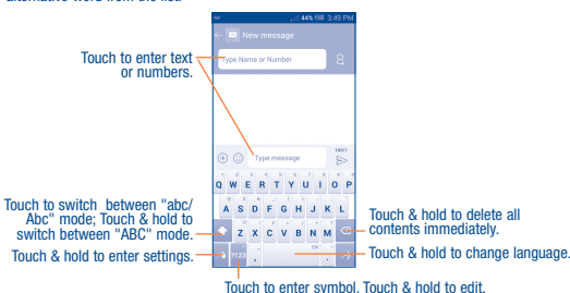
2.2 Text editing