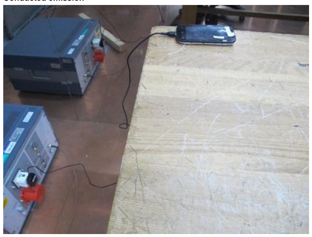
FDD ID RAD498 Conducted emission