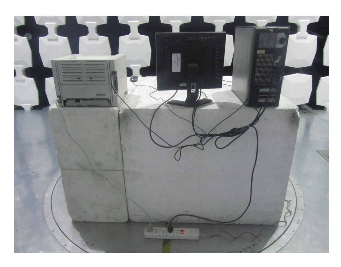
Radiated Spurious Emission