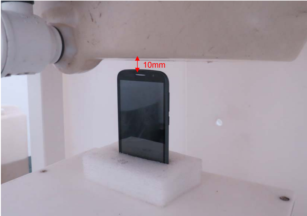
Picture 21: Top Edge, the distance from handset to the bottom of the Phantom is 10mm