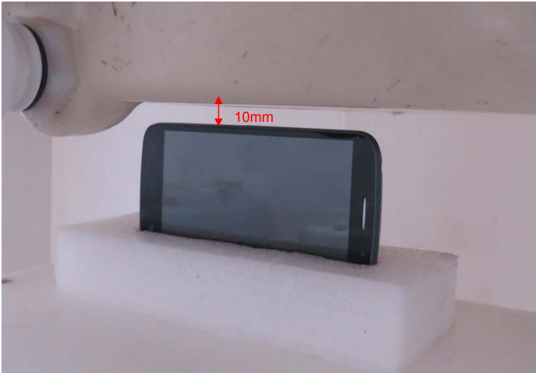
Picture 19: Left Edge, the distance from handset to the bottom of the Phantom is 10mm