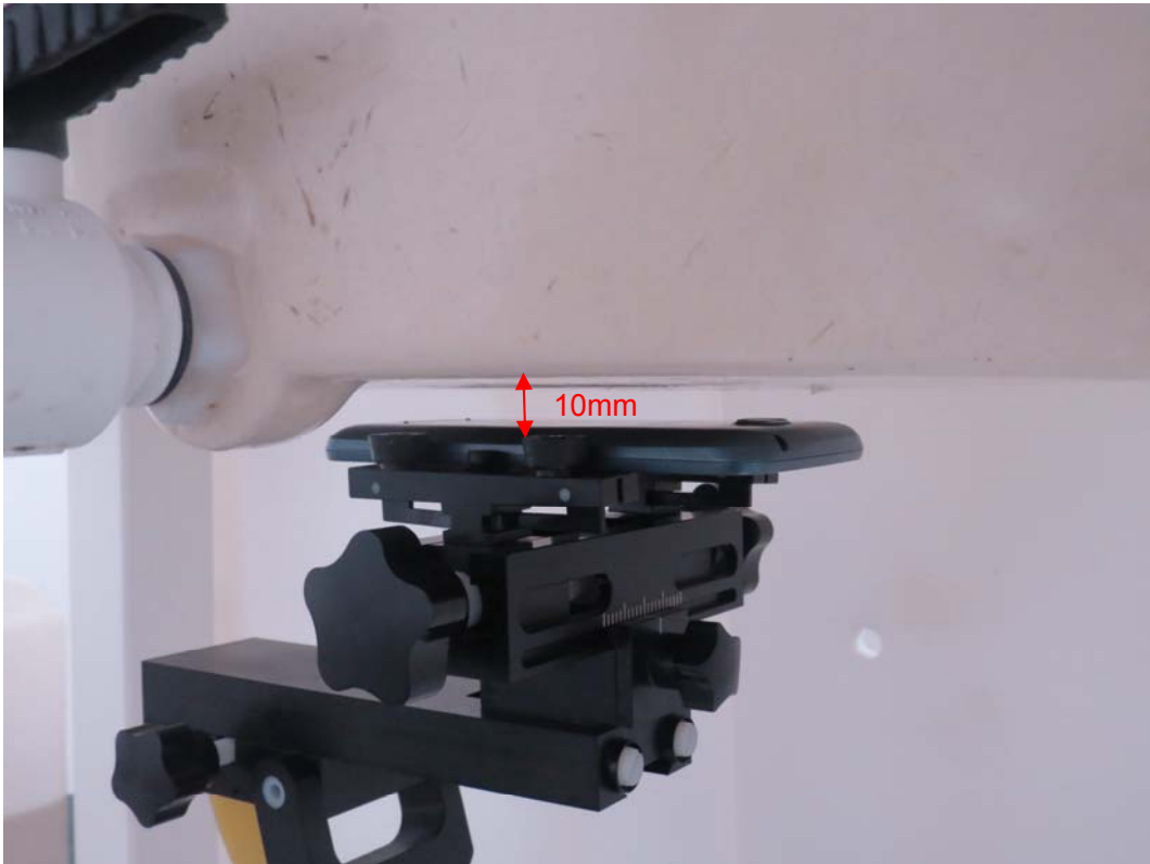
Picture 17: Back Side, the distance from handset to the bottom of the Phantom is 10mm