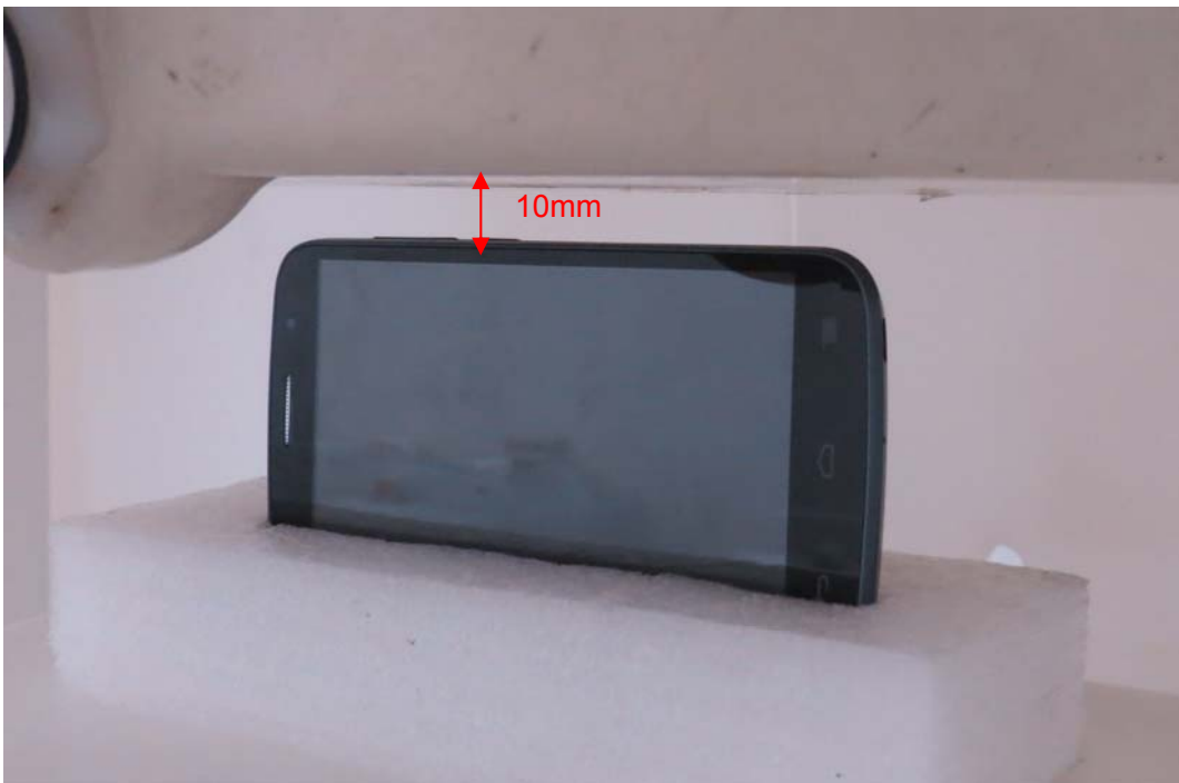
Picture 20: Right Edge, the distance from handset to the bottom of the Phantom is 10mm