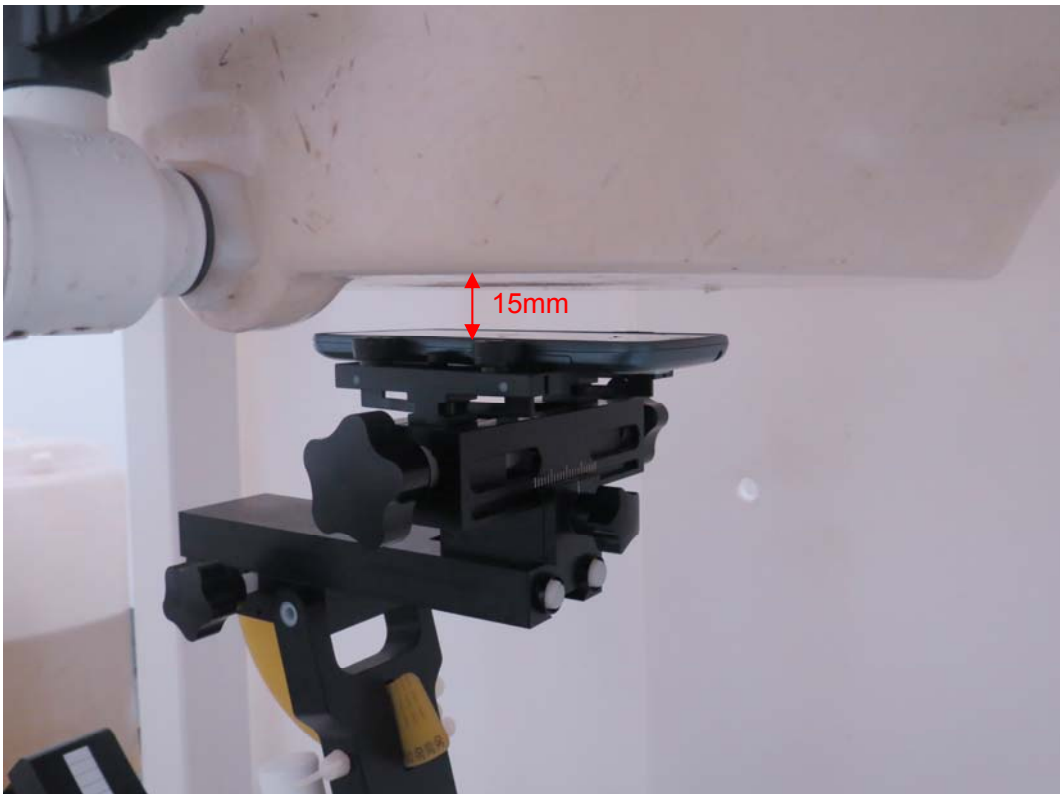
Picture 16: Front Side, the distance from handset to the bottom of the Phantom is 15mm