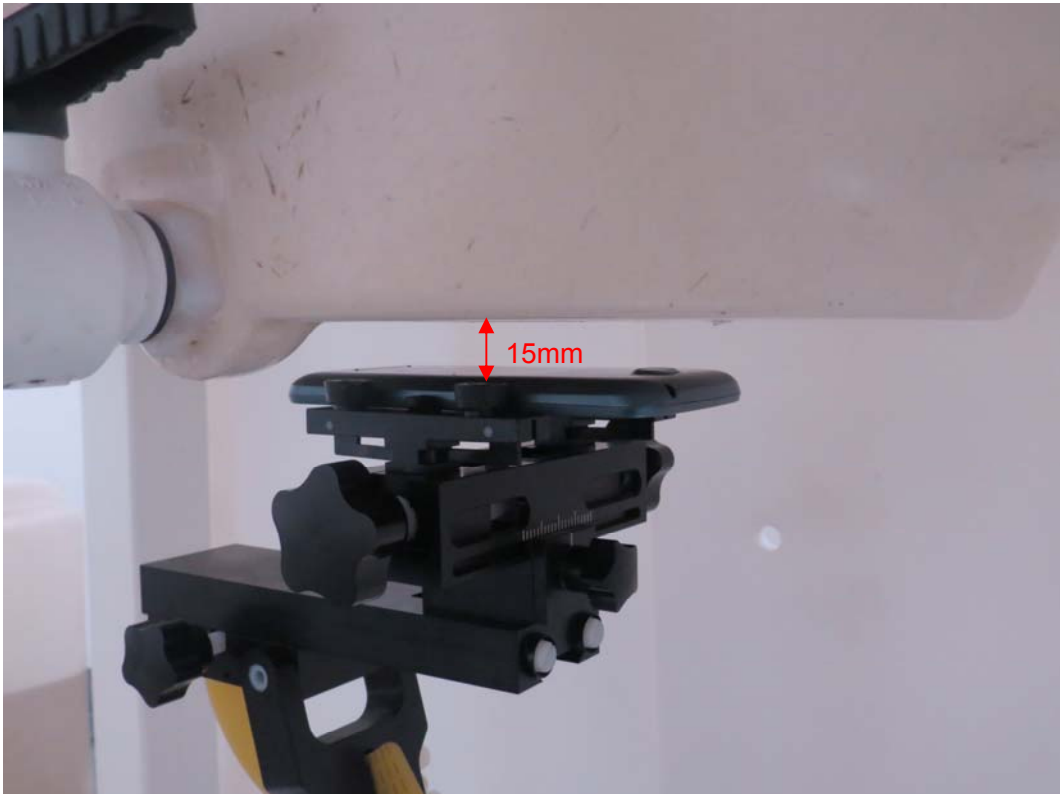
Picture 15: Back Side, the distance from handset to the bottom of the Phantom is 15mm