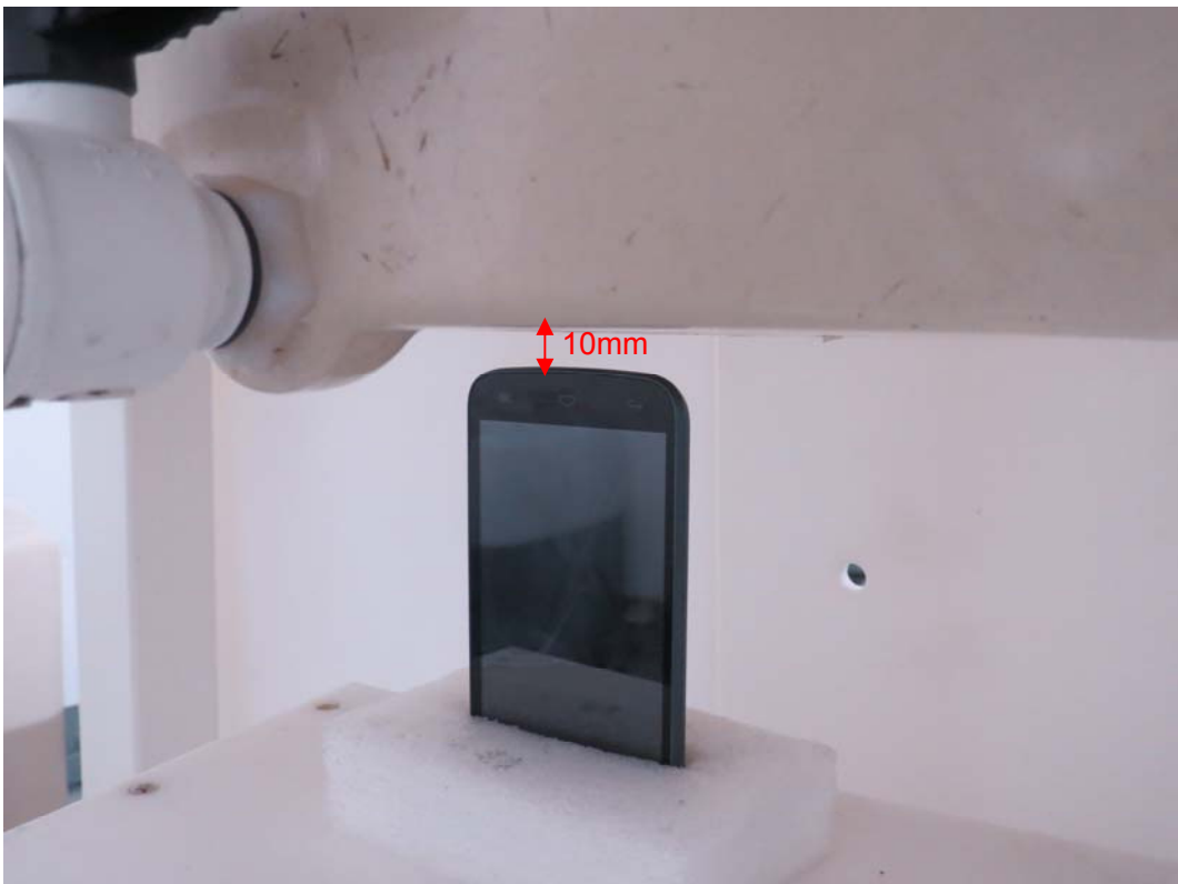
Picture 22: Bottom Edge, the distance from handset to the bottom of the Phantom is 10mm