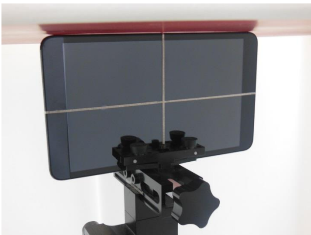
Edge2, Test Separation 0 cm