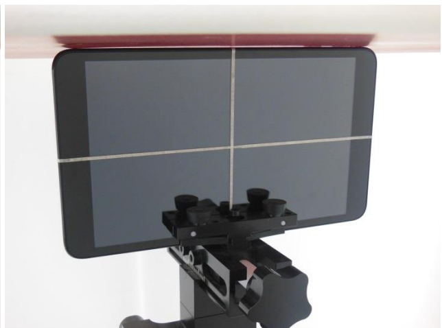
Edge4, Test Separation 0 cm