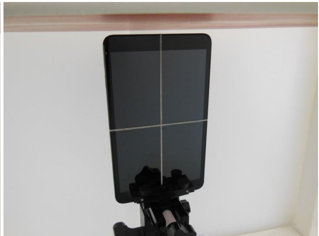
Edge1, Test Separation 0.9 cm