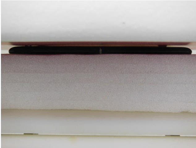
Bottom Face, Test Separation 0 cm