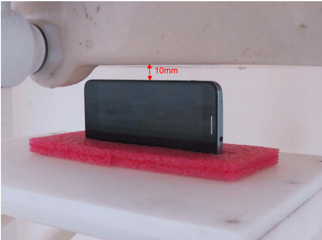
Picture 21: Left Edge, the distance from handset to the bottom of the Phantom is 10mm