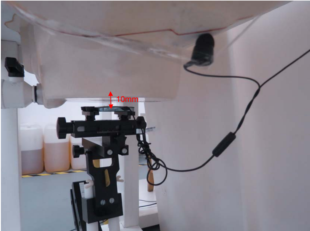
Picture 25: Back Side with Earphone 1, the distance from handset to the bottom of the Phantom is 10mm