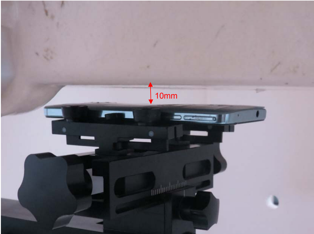
Picture 19: Back Side, the distance from handset to the bottom of the Phantom is 10mm