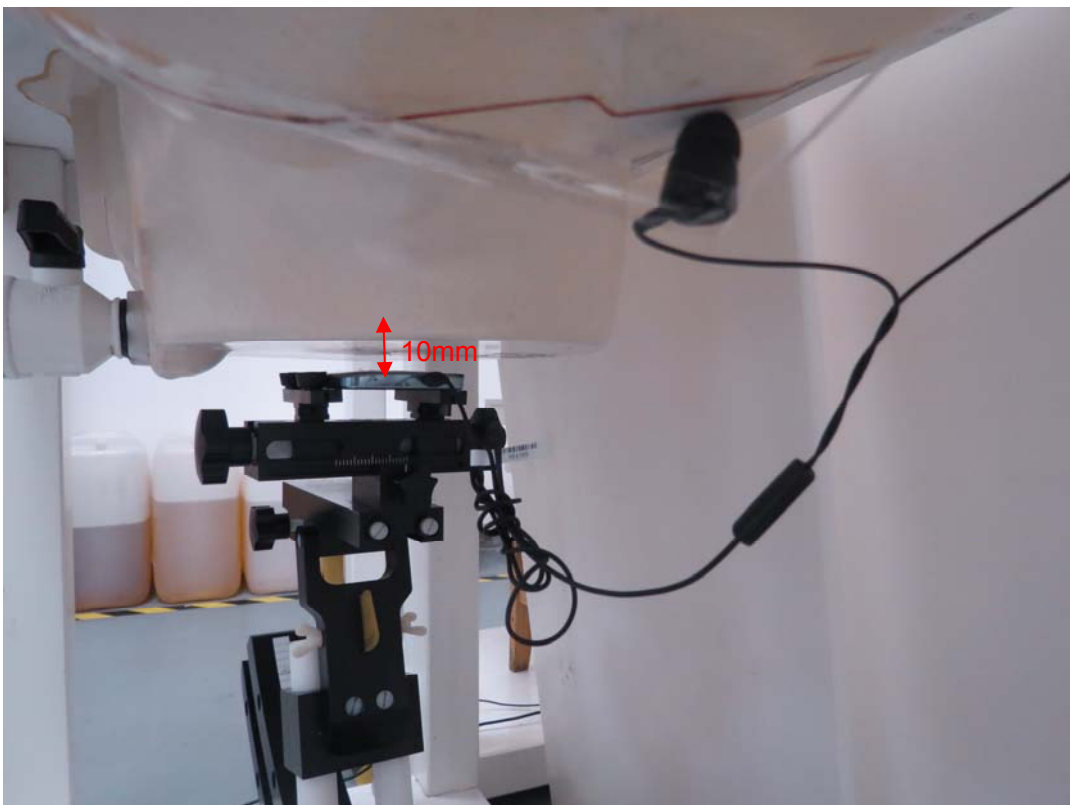
Picture 26: Back Side with Earphone 2, the distance from handset to the bottom of the Phantom is 10mm