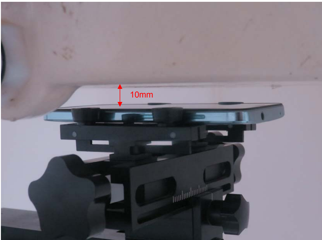
Picture 20: Front Side, the distance from handset to the bottom of the Phantom is 10mm