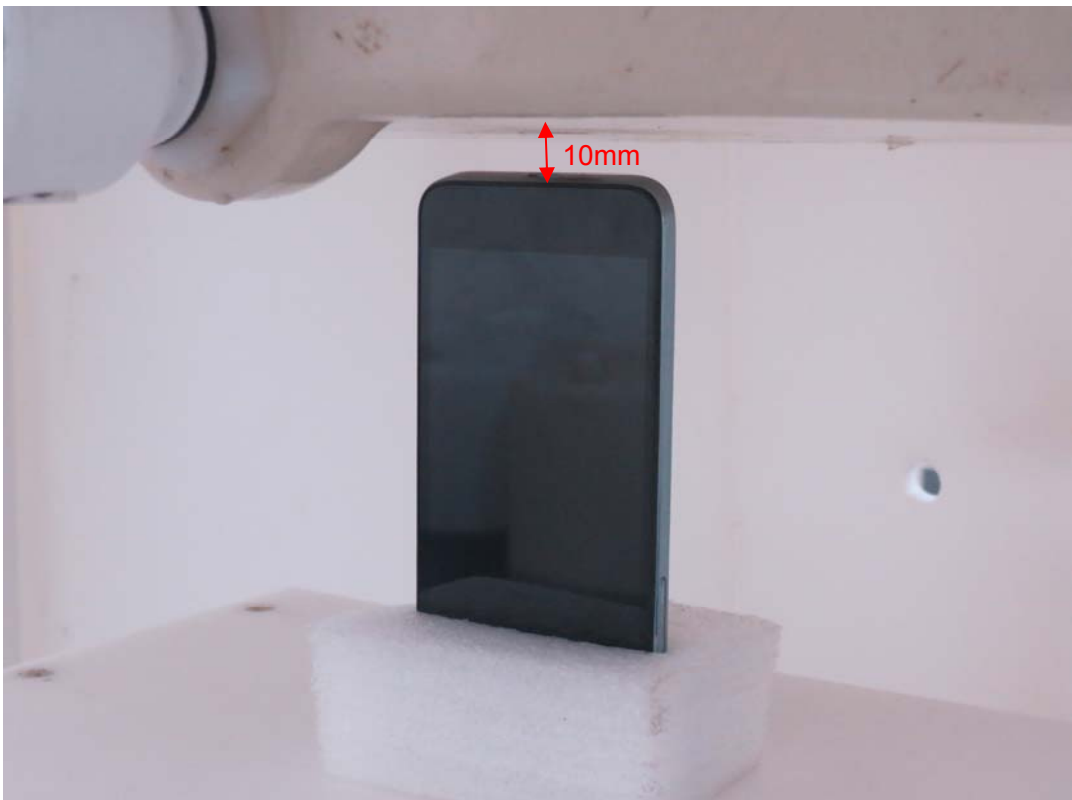
Picture 24: Bottom Edge, the distance from handset to the bottom of the Phantom is 10mm