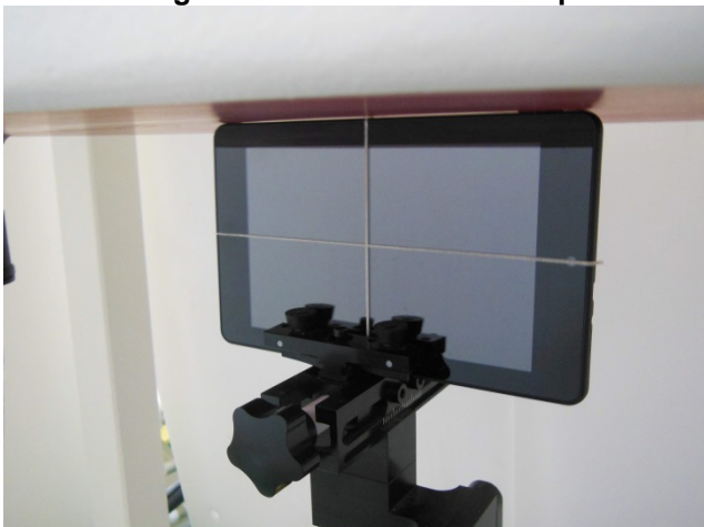
Edge 4 with Phantom 0 cm Gap