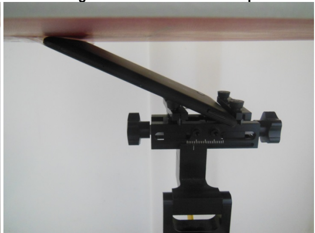
Curved surface of Edge3 with Phantom 0 cm Gap