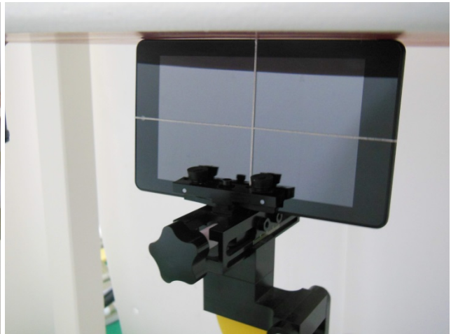
Edge 2 with Phantom 0 cm Gap