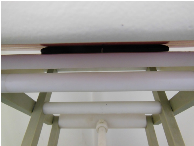
Bottom Face of Tablet with Phantom 0 cm Gap