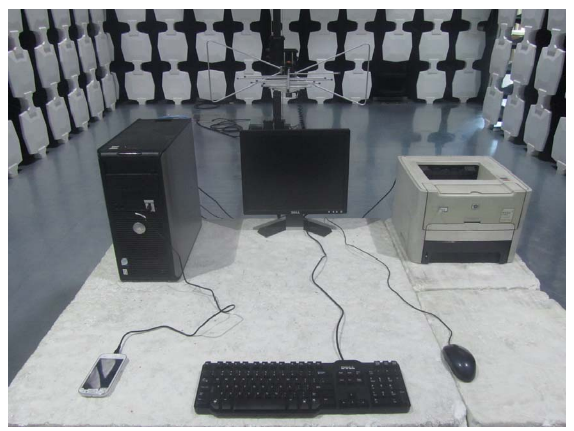
Radiated Spurious Emission