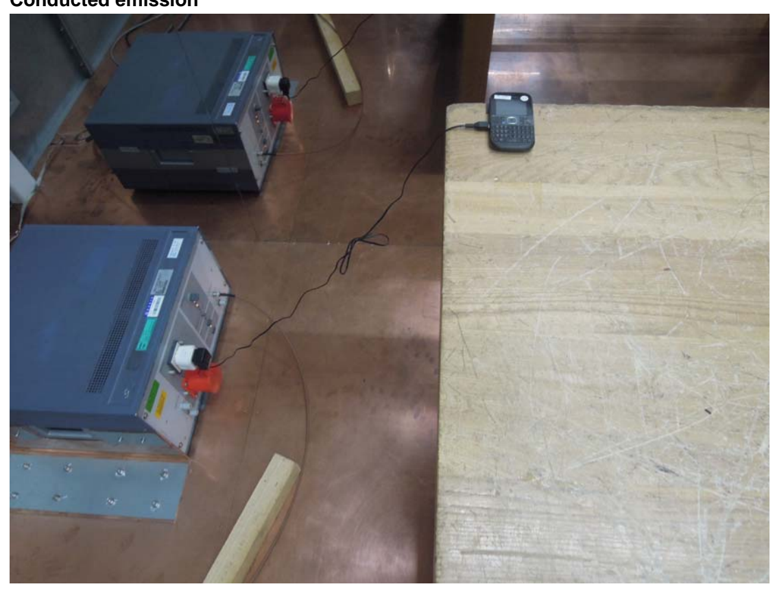
FDD ID RAD415 Conducted emission