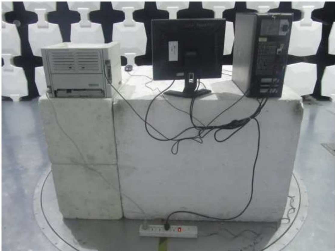
Radiated Spurious Emission