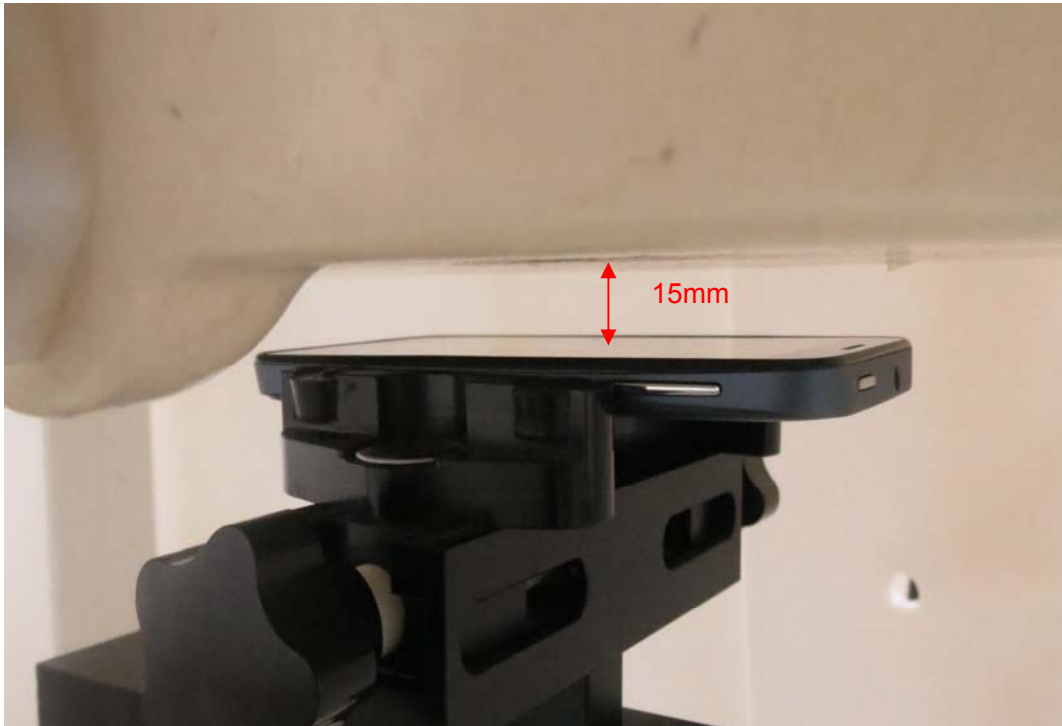
Picture 17: Front Side, the distance from handset to the bottom of the Phantom is 15mm