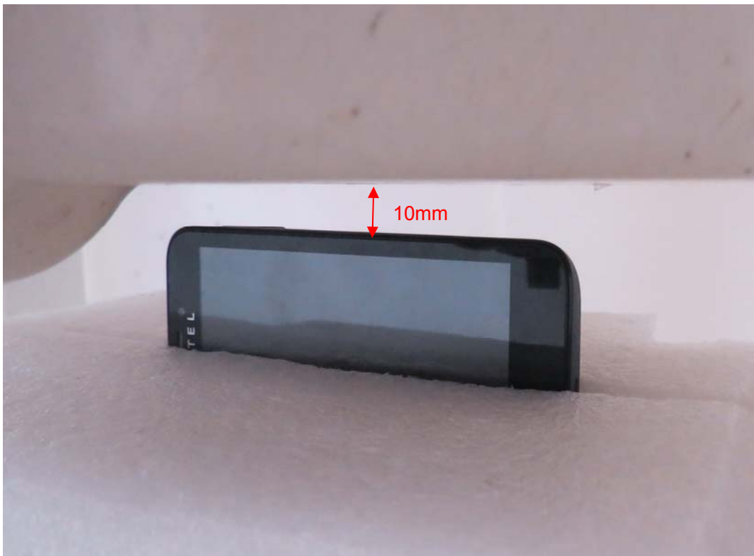
Picture 20: Right Edge, the distance from handset to the bottom of the Phantom is 10mm