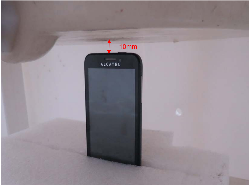
Picture 21: Top Edge, the distance from handset to the bottom of the Phantom is 10mm