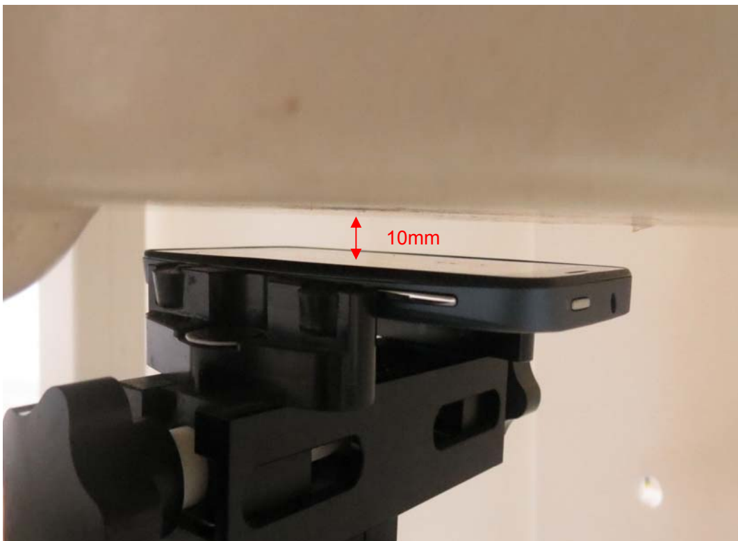
Picture 18: Front Side, the distance from handset to the bottom of the Phantom is 10mm