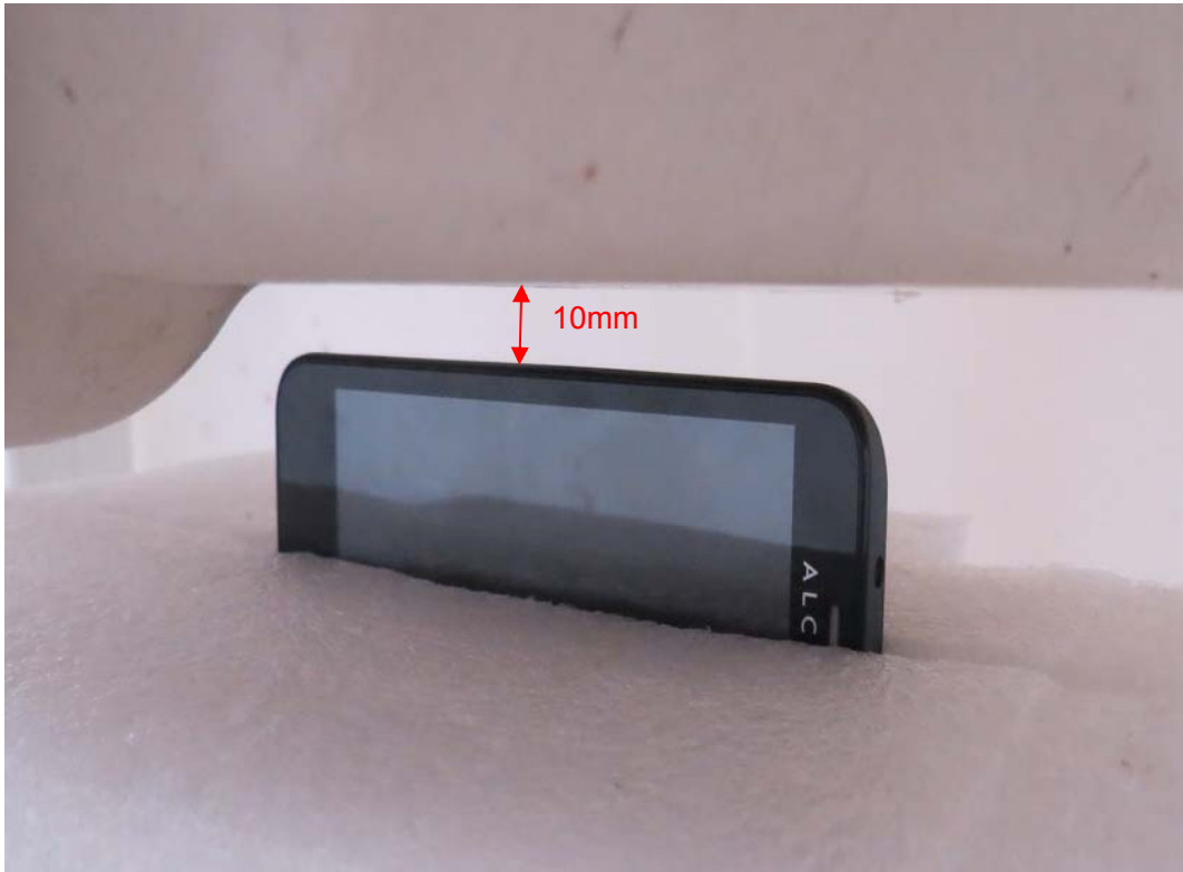
Picture 19: Left Edge, the distance from handset to the bottom of the Phantom is 10mm