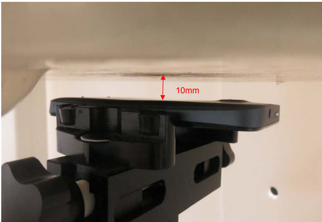
Picture 16: Back Side, the distance from handset to the bottom of the Phantom is 10mm