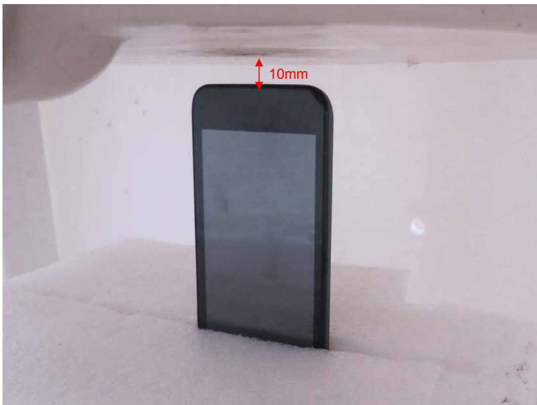
Picture 22: Bottom Edge, the distance from handset to the bottom of the Phantom is 10mm