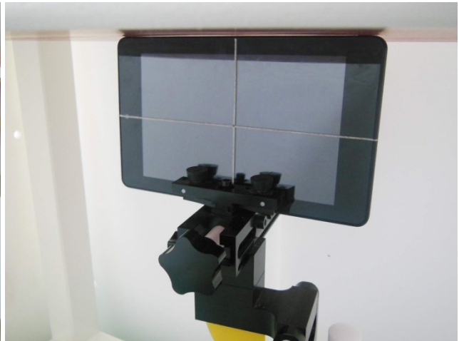
Edge 2 with Phantom 0 cm Gap