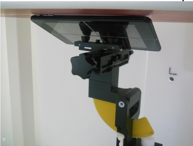
Curved surface of Edge2 with Phantom 0 cm Gap