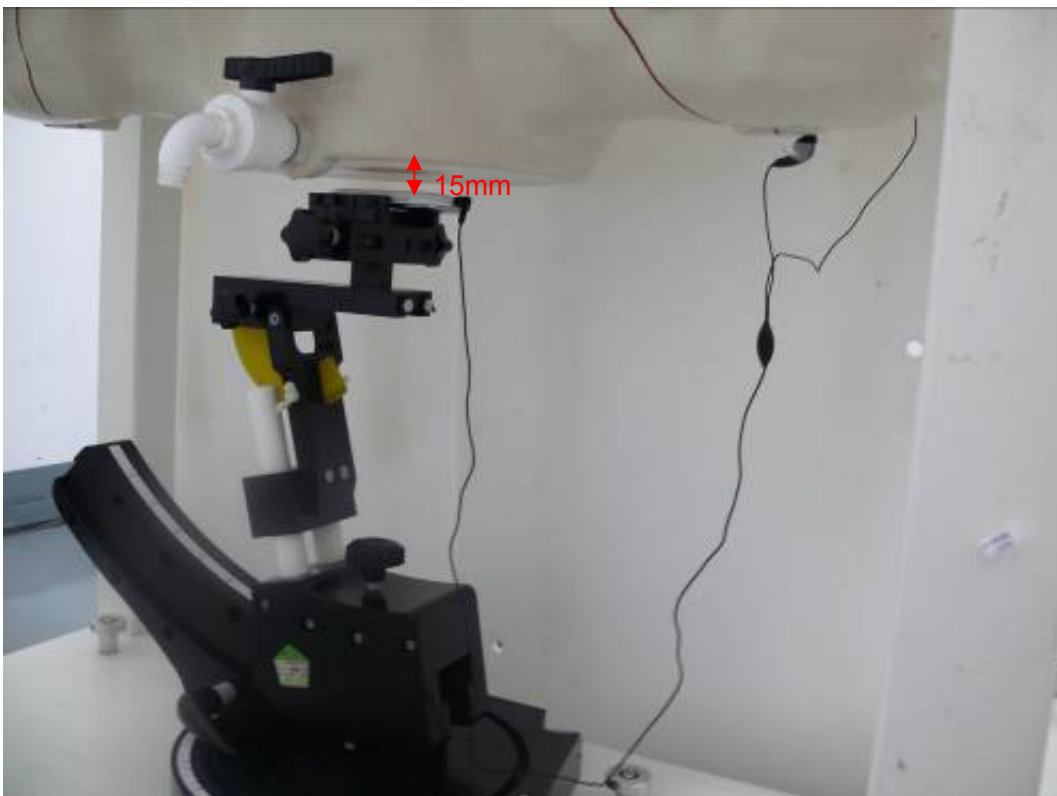
Picture 14: Body with Stereo Headset 2, The EUT display towards ground, the distance from EUT to the bottom of the Phantom is 15mm