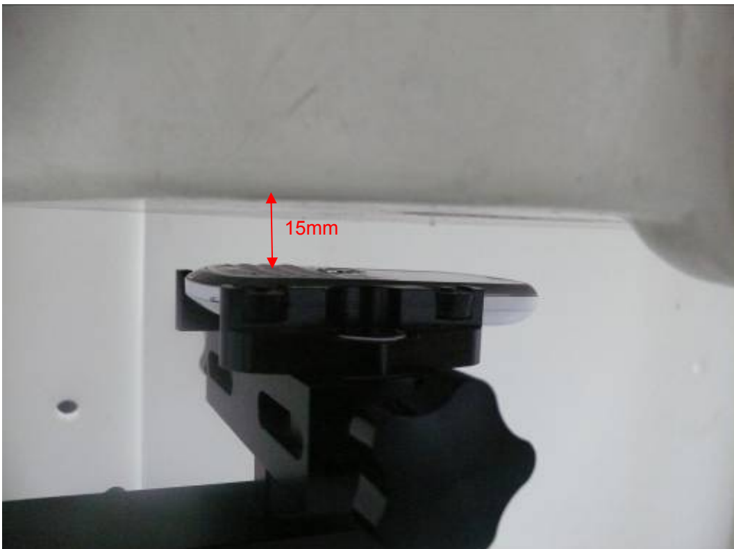
Picture 12: Body, The EUT display towards phantom, the distance from EUT to the bottom of the Phantom is 15mm