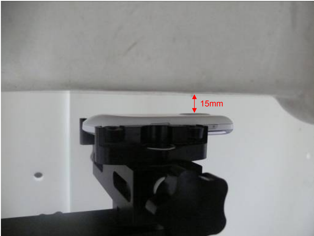
Picture 11: Body, The EUT display towards ground, the distance from EUT to the bottom of the Phantom is 15mm