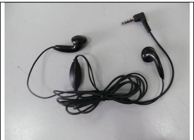
b-2: Stereo Headset 2