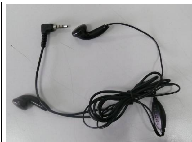
b-1: Stereo Headset 1