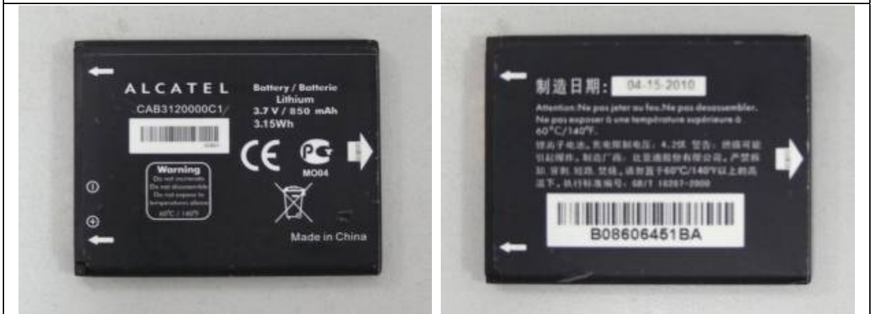
c-2: Battery 2