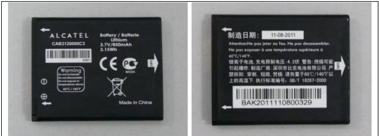
c-1: Battery 1