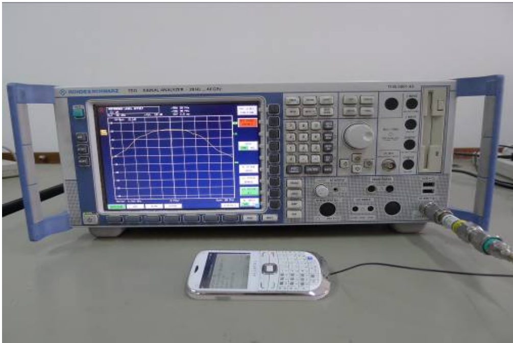
Spurious RF Conducted Emissions Test setup