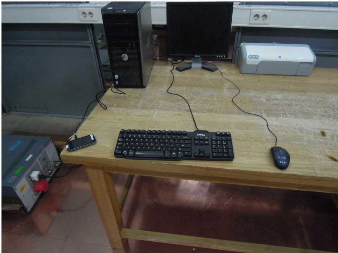
Part15B conducted emission