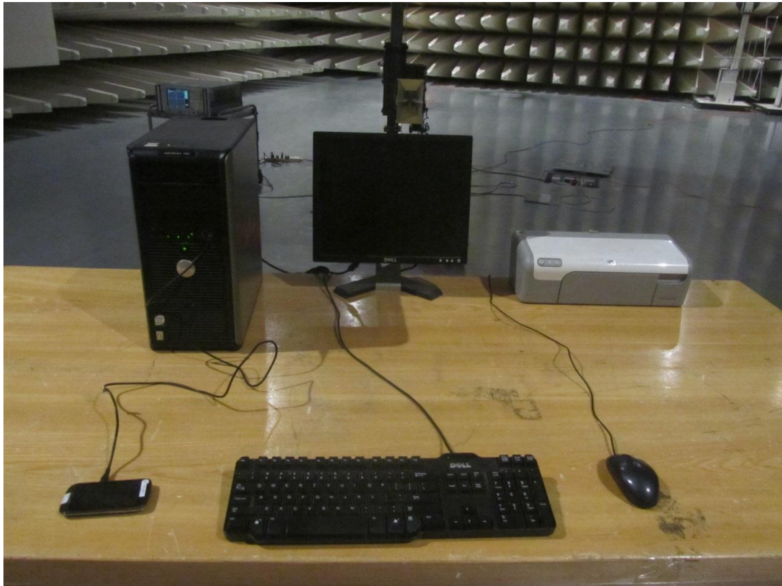
Part15B radiated emission