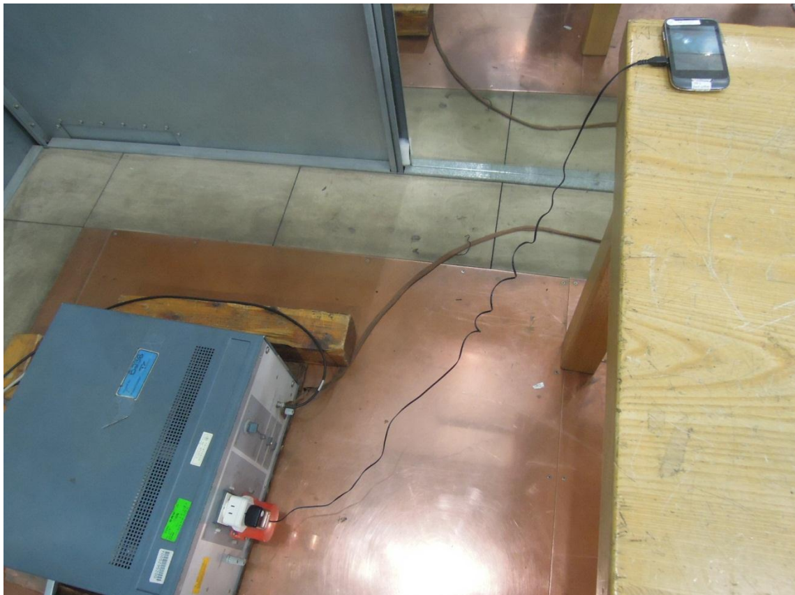
Part15C conducted emission